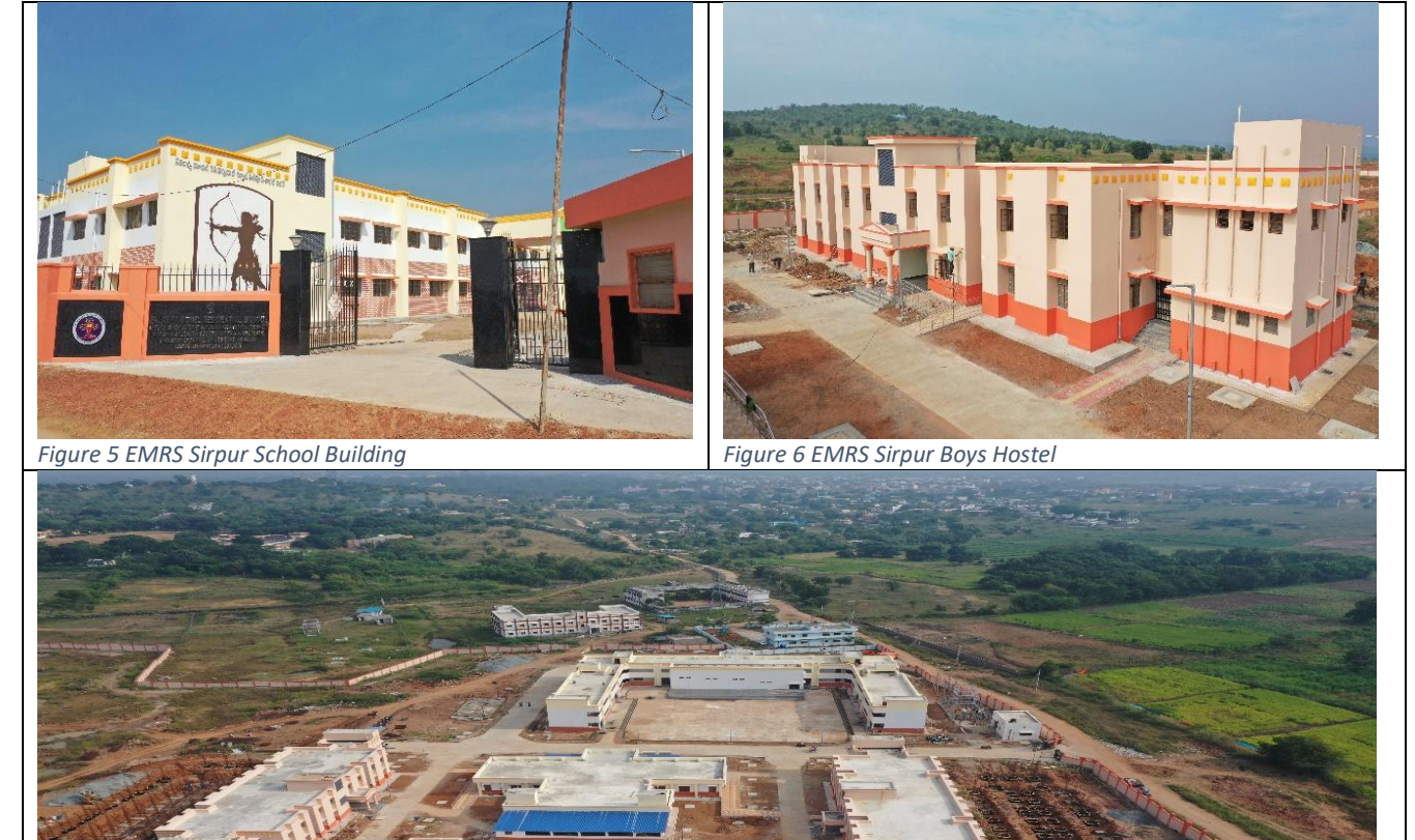
Figure 7 EMRS Sirpur Bird View

At present this school is functional in other government building wherein 211 students are studying from class 6<sup>th</sup> to 9<sup>th</sup>.