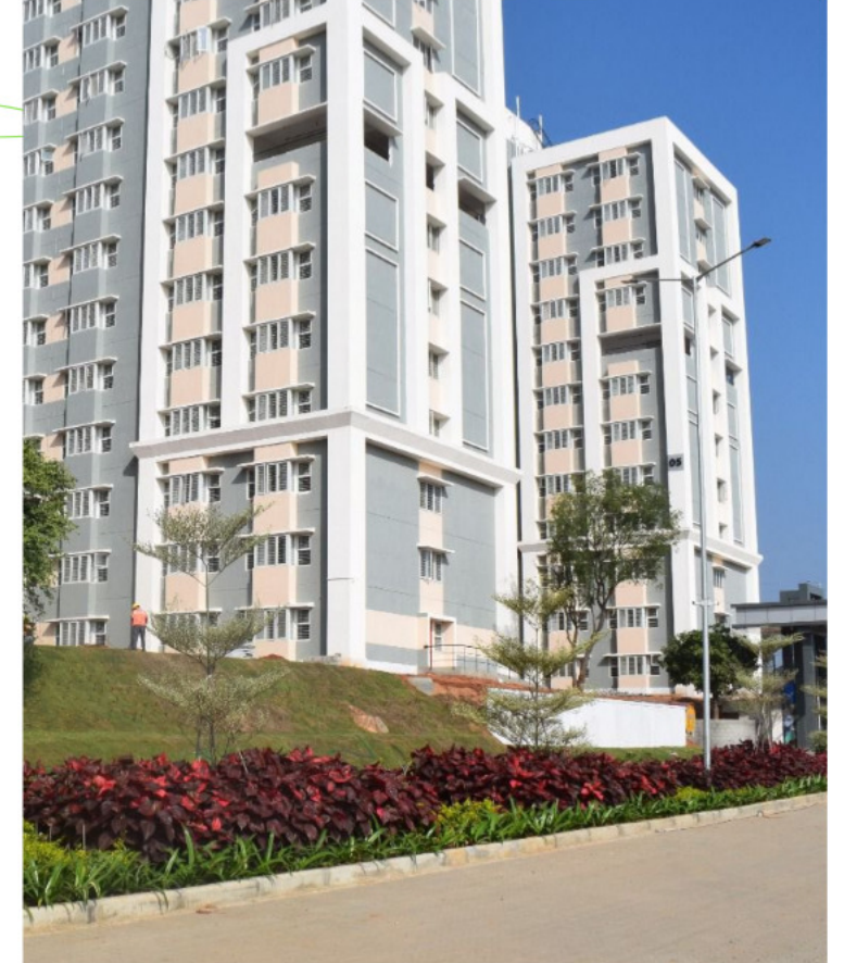
PM Awaas Yojana Rs 5,36,137 Cr