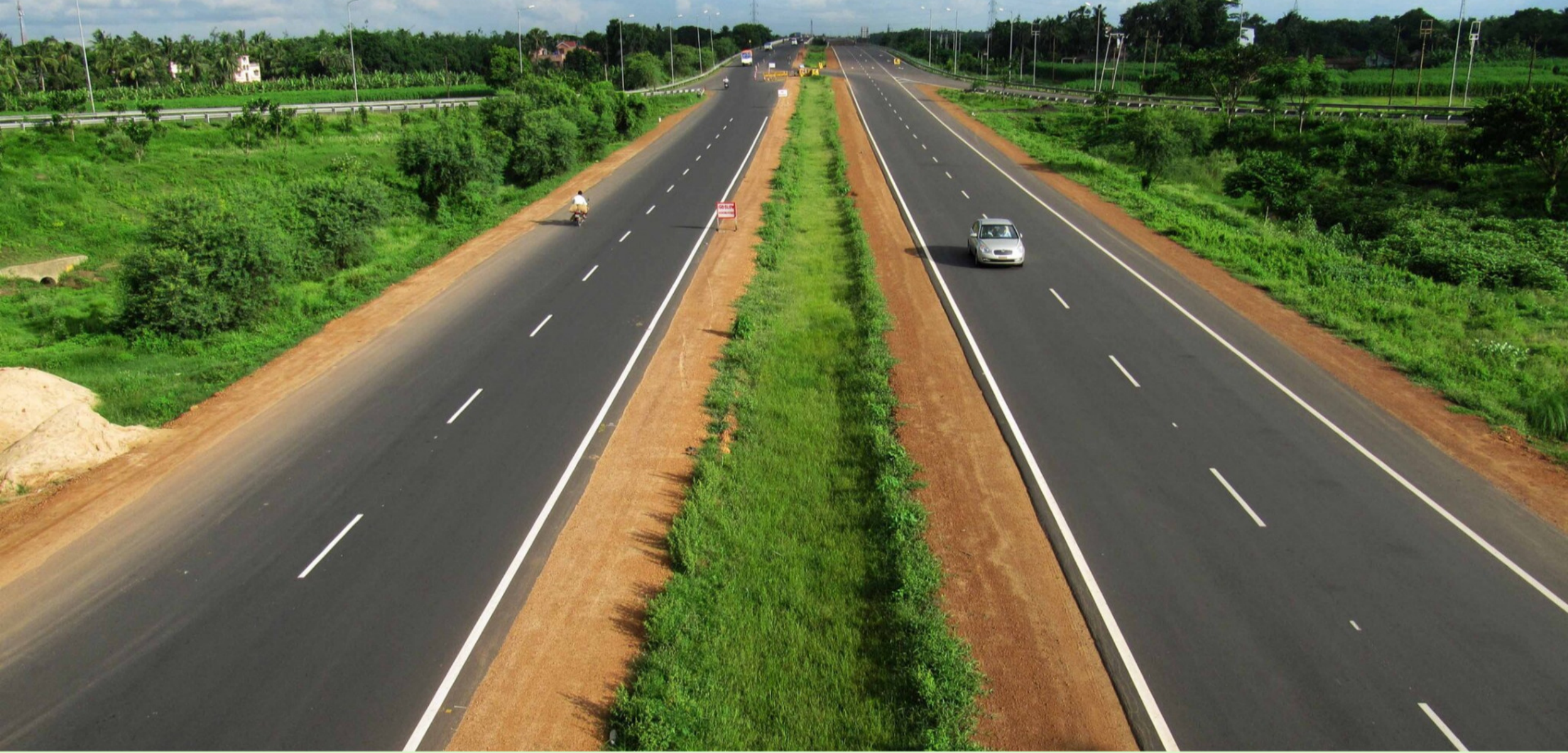
4 laning of Barabanki - Bahraich section of NH 927 (101.5 km; Rs 6,969 Cr)