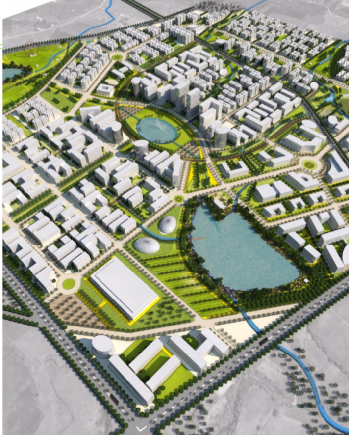
12 Industrial smart cities + Industrial parks Rs 62,262 Cr