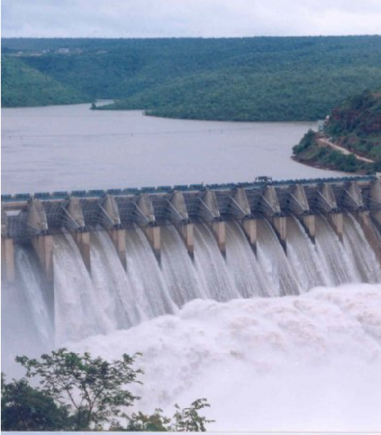
Hydro projects + budgetary Support Rs 31,017 Cr