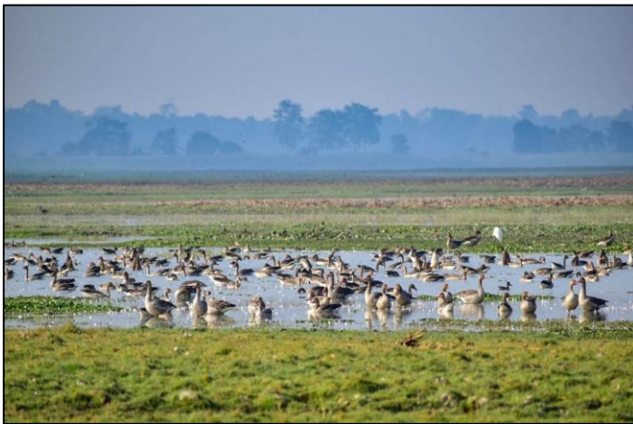
Panidihing Bird Sanctuary, Assam

India's commitment to sustainable tourism is also gaining global recognition. Mamallapuram