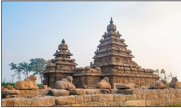
Group of Monuments at Mahabalipuram, Tamil Nadu

such as Himalayan trekking trails , birdwatching circuits , and curated turtle tourism experiences are helping distribute visitor flows while creating new opportunities in lesser-known destinations. Sustainability is being further prioritised through the Travel for LiFE program, which encourages tourists, businesses and local communities to adopt environmentally responsible practices and make conscious choices that minimise their ecological footprint.