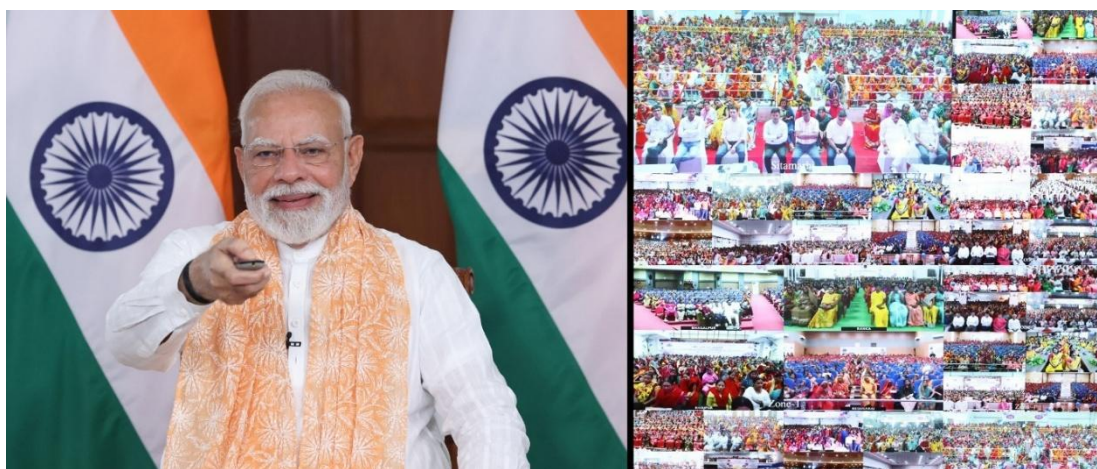
PM launches Bihar Rajya Jeevika Nidhi Saakh Sahkari Sangh Limited via video conferencing on 02/09/2025

This initiative is expected to strengthen rural women's entrepreneurship and expand community-based enterprises. The participation of nearly 20 lakh women in the launch event reflected the large-scale impact of the programme.