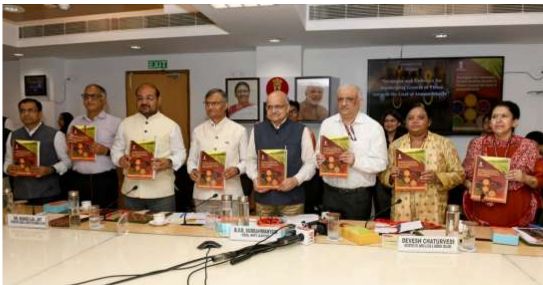
Launch of NITI Aayog Report on Aatmanirbharta in Pulses on September 4, 2025

Based on insights from 885 farmers across five major pulses-growing states, Rajasthan, Madhya Pradesh, Gujarat, Andhra Pradesh, and Karnataka, NITI Aayog has outlined recommendations to strengthen the pulses sector, enhance productivity, and ensure sustainability. Key measures include expanding pulses into rice fallows and diversifying cropping patterns through a cluster-based approach, complemented by incentives, assured prices, and pilot projects in high-potential states. To strengthen seed systems, NITI Aayog advocates for high-quality seed supply and traceability via models such as “One Block–One Seed Village”, supported by cluster-based seed hubs and Farmer-Producer Organizations (FPOs) to ensure the timely availability of improved varieties and higher yields. Strengthening procurement and value chains through local procurement centers and processing units will reduce intermediaries, improve farmer incomes, and stabilize consumer prices. Integrating pulses into nutrition and welfare programs such as PDS and Mid-Day Meals will boost demand and address malnutrition. The report (Refer NITI Aayog report here ) emphasizes mechanization, efficient irrigation, and bio-fertilizers for sustainable productivity, alongside pest-resistant, short-duration, and climate-resilient varieties, supported by early warning systems and data-driven monitoring via the SAATHI Portal, to make pulses cultivation more resilient and rewarding.