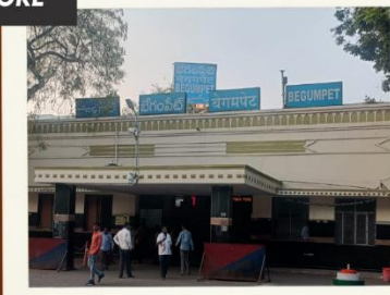
BEGUMPET (HYDERABAD), TELANGANA