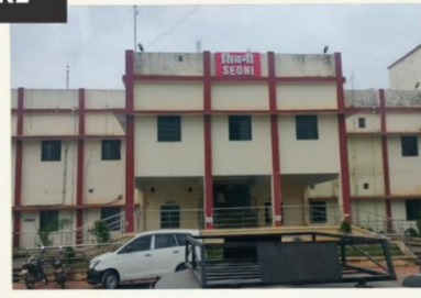
SEONI, MADHYA PRADESH