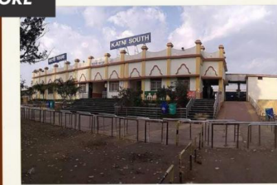
KATNI SOUTH, MADHYA PRADESH