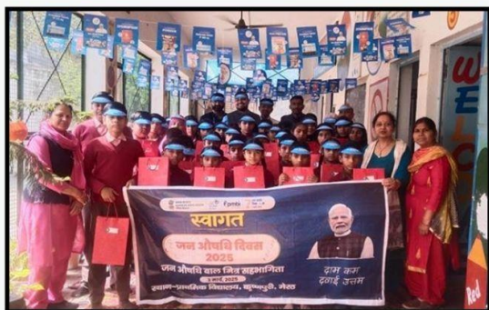
Jan Aushadhi Bal Mitra-Children Participation