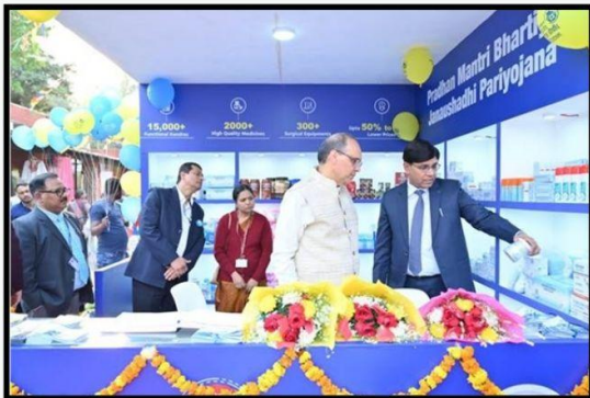
Jan Aushadhi Jan Chetna Abhiyan

2 featured Jan Arogya Mela with heritage walks and 500+ health camps for senior citizens. Day 3 focused on children's participation and distributing nutraceutical products. Day 4 highlighted women's involvement with sanitary pad distribution to showcase the affordability of Jan Aushadhi products. Day 5 organized pharmacist awareness seminars in 30 cities. Day 6 featured the Jan Aushadhi Mitra Volunteer Registration Campaign and Day 7 will culminate with the Jan Aushadhi Diwas Celebration.