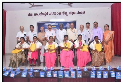
Jan Aushadhi Ek Kadam Matri Shakti Ki Ore-Women Participation