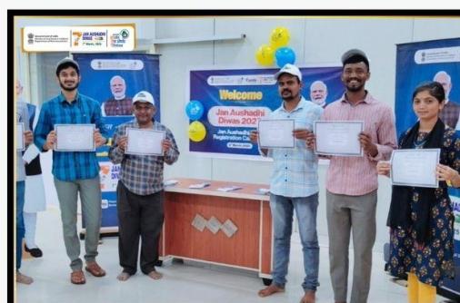
Jan Aushadhi Mitra Volunteer Registration Campaign