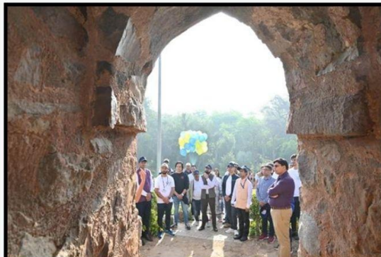
Jan Arogya Mela (Heritage Walks & Health Camps) for Senior Citizens