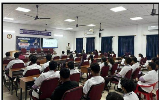
Jan Aushadhi Seminar-Pharmacist Awareness