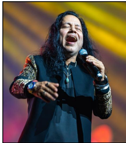
Mr. Kailash Kher