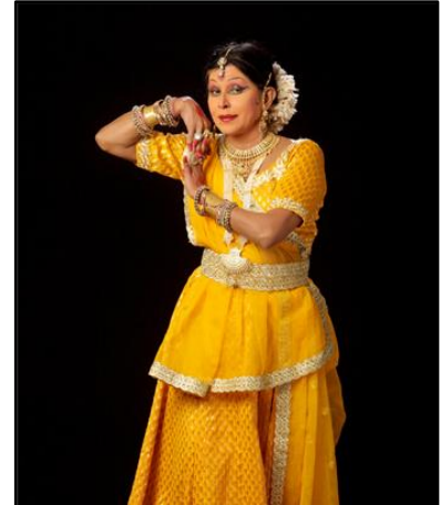
Mrs. Shovana Narayan