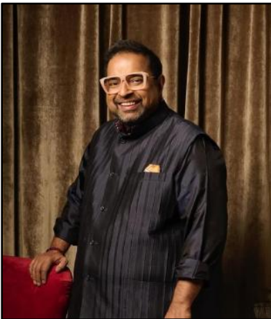
Mr. Shankar Mahadevan

The Maha Kumbh Mela , one of the largest spiritual gatherings in the world, serves as a confluence not only of rivers but also of cultures, traditions, and artistic expressions . This grand event, celebrated every twelve years, transcends the boundaries of religion and spirituality, offering a platform to showcase India's rich cultural heritage. Among its many facets, the performances by cultural artists hold a special place, captivating millions with their music, dance, and theatrical renditions that narrate stories of faith, devotion, and history. From classical dances to folk traditions, these performers weave a vibrant tapestry of India's cultural diversity , enhancing the spiritual experience for pilgrims and visitors alike.