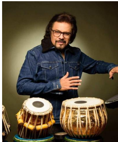
Mr. Bickram Ghosh