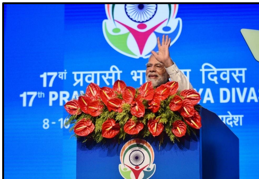
Prime Minister Shri Narendra Modi addressing the 17th PBD in Indore, Madhya Pradesh

The 17th PBD Convention , held from January 8-10, 2023 , in Indore, Madhya Pradesh , focused on the theme “Diaspora: Reliable partners for India's progress in Amrit Kaal” . This event saw the participation of distinguished guests, including the Presidents of Guyana and Suriname , underlining the global significance of the Indian diaspora.