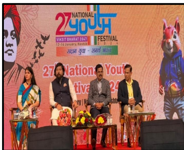
A glimpse from the 27 th National Youth Awards held in 2024 in Nashik

NYLP focuses on fostering leadership and innovation among young individuals to enable them to contribute effectively to social and economic development. The aim of the programme is to create an institutional platform where youth can articulate their views and draw the attention of the local administration to such issues/ concerns affecting their lives, educate youth about contemporary socio-economic development issues and enable them share their experiences and ideas on community development and social welfare activities.