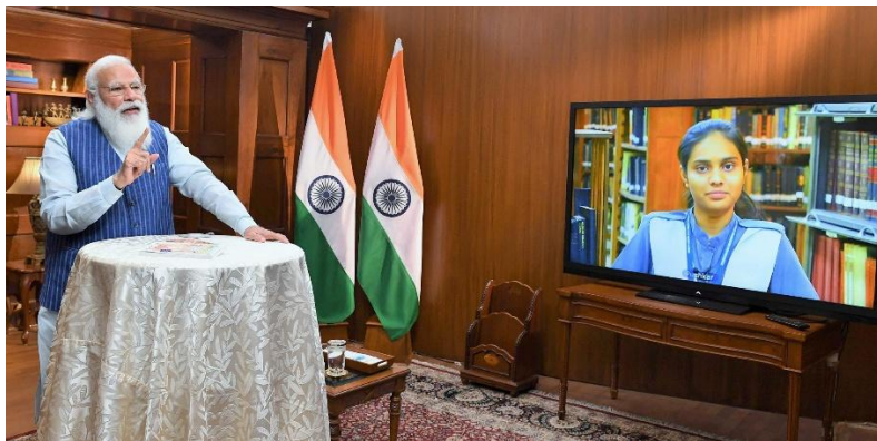
Pariksha Par Charcha 2021

In response to the COVID-19 pandemic, the fourth edition of PPC was held online on 7 April 2021 . Despite the challenges posed by the pandemic, the interaction continued to inspire students and their families. The focus shifted to resilience and adaptability, teaching life skills to help students navigate uncertain times.