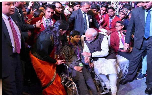
Pariksha Par Charcha 2019