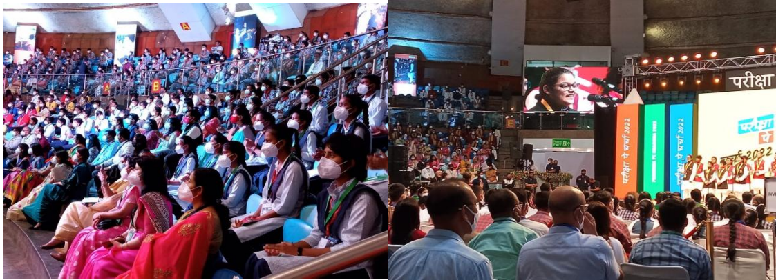
Pariksha Par Charcha 2022

parents viewed the live programme of Pariksha Pe Charcha-2022. The programme was telecast live by the many TV Channels and YouTube channel etc