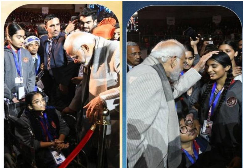
Pariksha Par Charcha 2023

The 6th Edition of PPC was conducted on 27 January 2023 at Talkatora Stadium, New Delhi . Hon'ble Prime Minister of India interacted with students, teachers and parents during this programme and gave his valuable suggestions/ inputs to all stakeholders. The programme was telecast live by many TV Channels and YouTube channels. 718110 students, 42337 employees and 88544 Parents viewed the live programme of PPC-2023. The interaction of the Hon'ble Prime Minister of India with students, teachers and parents was inspiring, motivating thought-provoking for all.