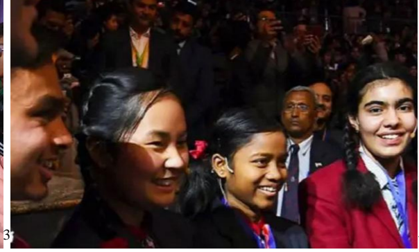
Pariksha Par Charcha 2024