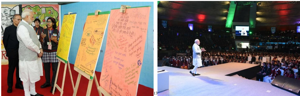
Pariksha Par Charcha 2018