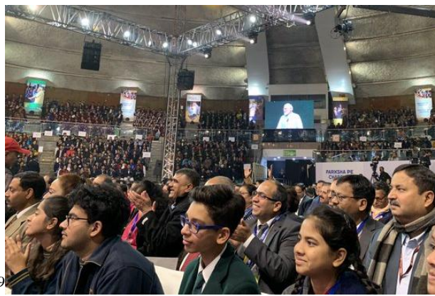
Pariksha Par Charcha 2020