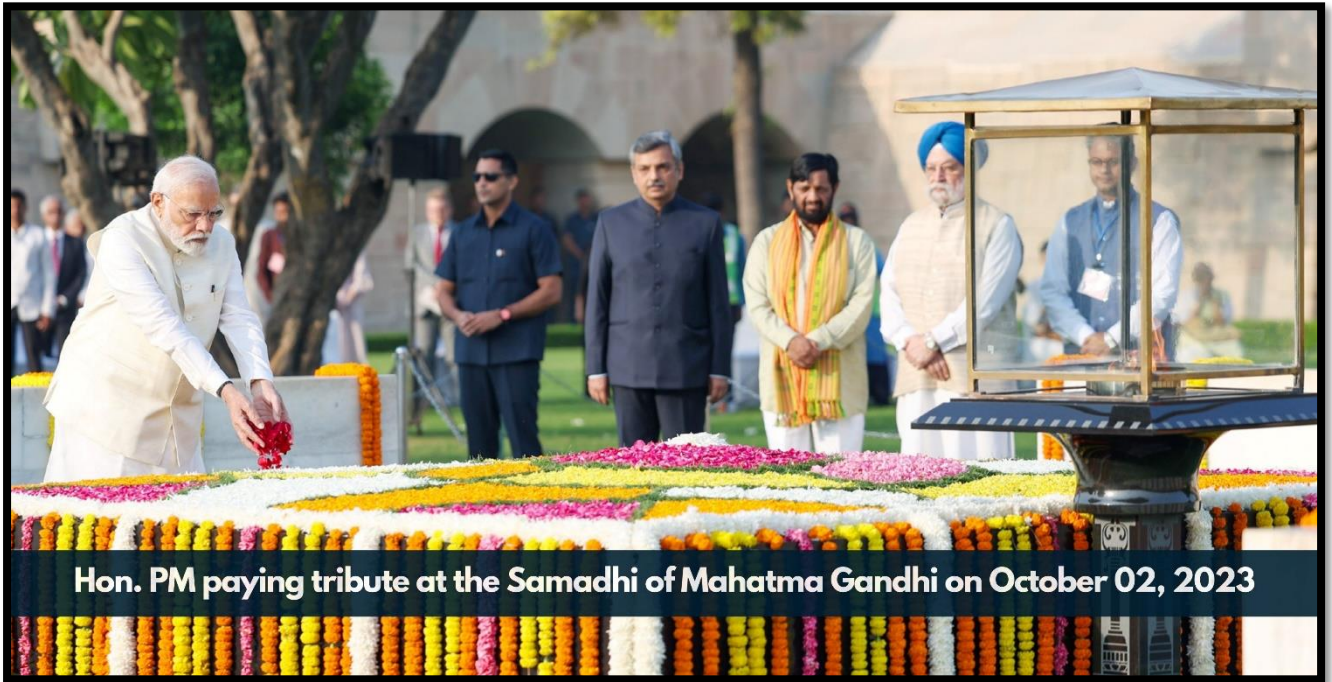
Hon. PM paying tribute at the Samadhi of Mahatma Gandhi on October 02, 2023