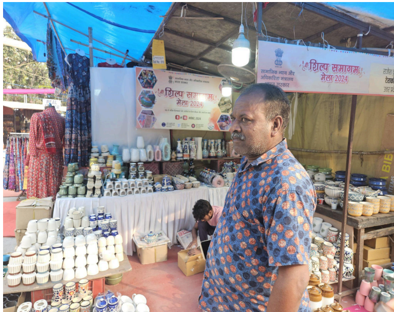
Curating clay and colours