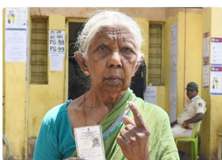
Bengaluru, Karnataka (Phase 2)