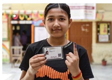
Meerut, Uttar Pradesh (Phase 2)