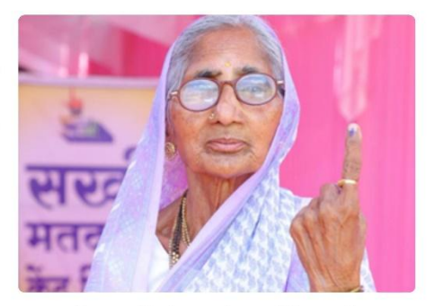
Latur, Maharashtra (Phase 3)