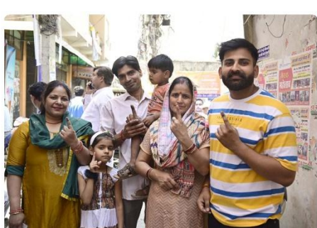
Meerut, Uttar Pradesh (Phase 2)