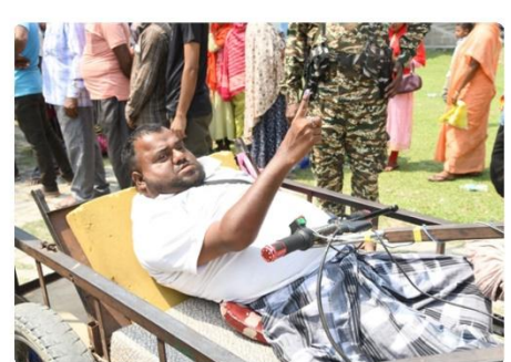
Mangaldoi, Assam (Phase 2)