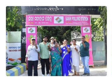
Berhampur, Odisha (Phase 4)