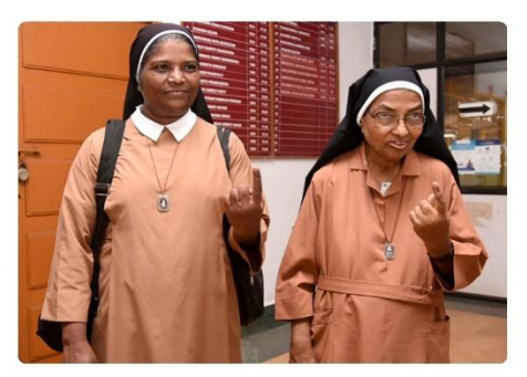
Panaji, Goa (Phase 3)