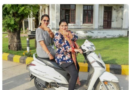
Jammu, Jammu & Kashmir (Phase 2)