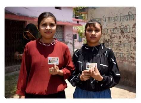
Bhopal, Madhya Pradesh (Phase 3)