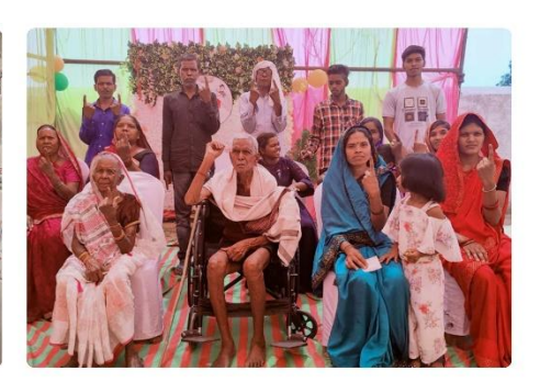
Obari, Chattisgarh (Phase 3)