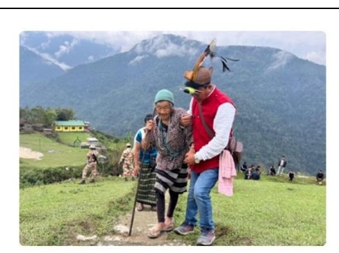
Kurung Kumey, Arunachal Pradesh (Phase 1)