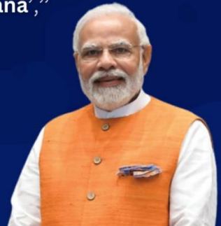
PM Narendra Modi

“ We will launch a scheme on the occasion of Vishwakarma Jayanti, benefiting individuals skilled in traditional craftsmanship, particularly from the OBC community . Weavers, goldsmiths, blacksmiths, laundry workers, barbers, and such families will be empowered through the ' Vishwakarma Yojana ',”