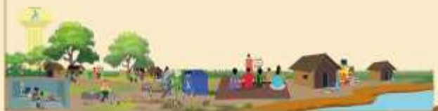
Ms. Gadge Meenakshi Sarpanch, Mukhra K Village, Adilabad District, Telangana

Mukhra K. Village which has 220 households and a population of 1080 individuals was declared ODF Plus Model in 2021 under the leadership of Sarpanch Gadge Meenakshi. All along, the village leader's focus while carrying out integrated development activities was to ensure an impact that is sustainable, leaving no one behind without access to hygiene and sanitation.