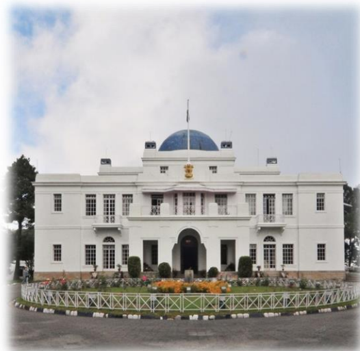
Raj Bhawan, Darjeeling