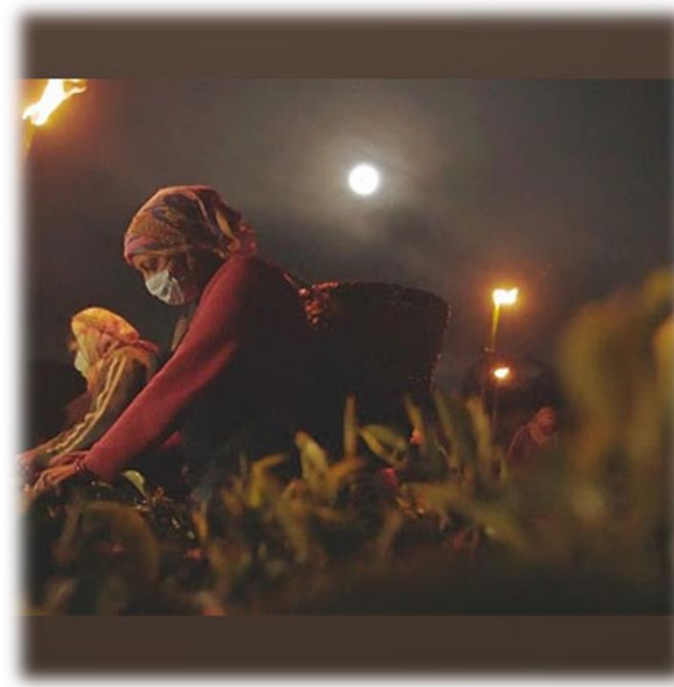
Moonlight Tea Leaf Plucking