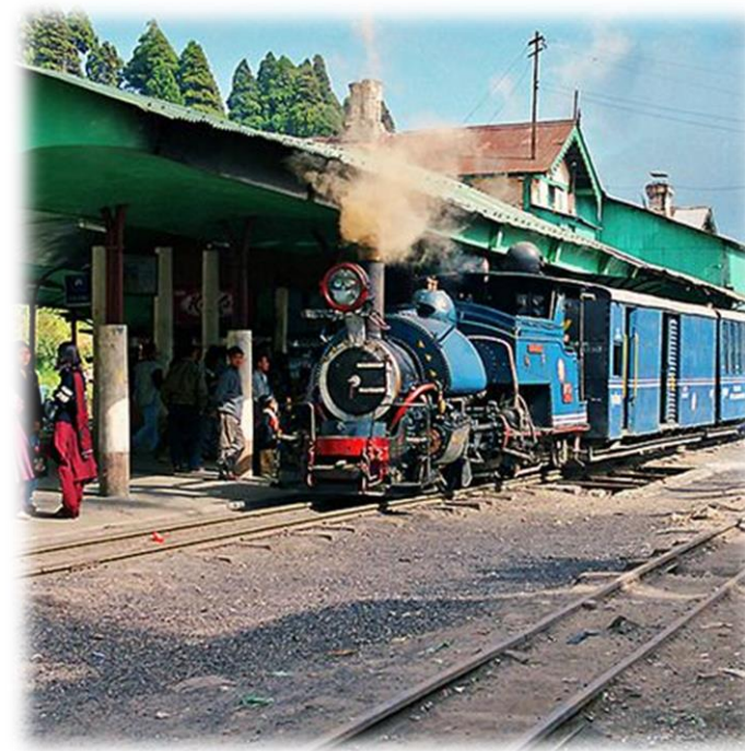
Ghum Station - India's Highest Railway Station (7407 ft)