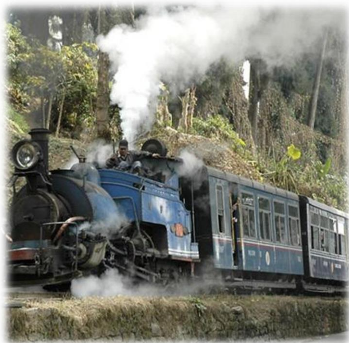
Darjeeling Himalayan Railways (DHR)