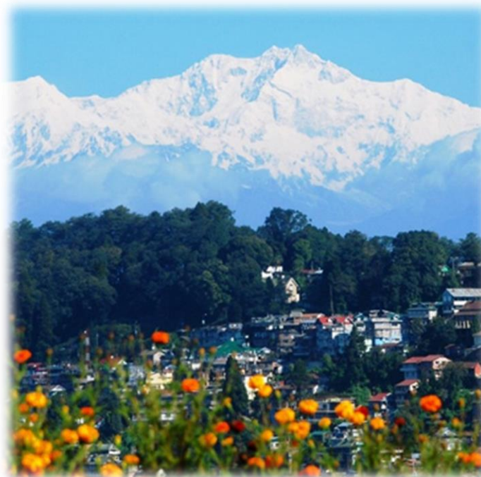
Kanchenjunga Views from Darjeeling