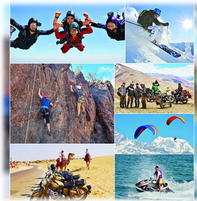
Side Event on Adventure Tourism