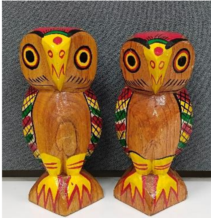
Set of 2 Wooden Dolls (Owl)