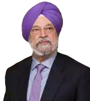
Hardeep Singh Puri

Minister of Petroleum and Natural Gas & Minister of Housing and Urban Affairs Government of India