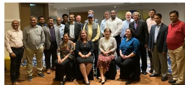
DOE Visiting Delegation and Indian Counterparts from ISPRL