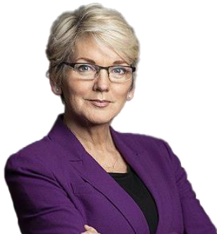
Jennifer M. Granholm