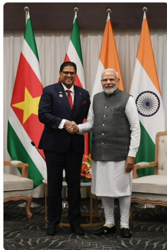
7:59 PM - Jan 9, 2023 - 430.7K Views

Had an excellent meeting with President @CSantokhi. We reviewed the full range of relations between India and Suriname. We discussed avenues of cooperation in futuristic areas like innovation, technology, maritime security and more. 🇮🇳 🇸🇷