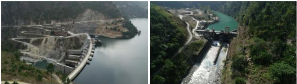
" Aerial shots of Kameng Dam and Hydro Power Station , Arunachal Pradesh"