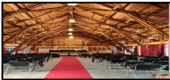
Bamboo Auditorium at NIT, Arunachal Pradesh