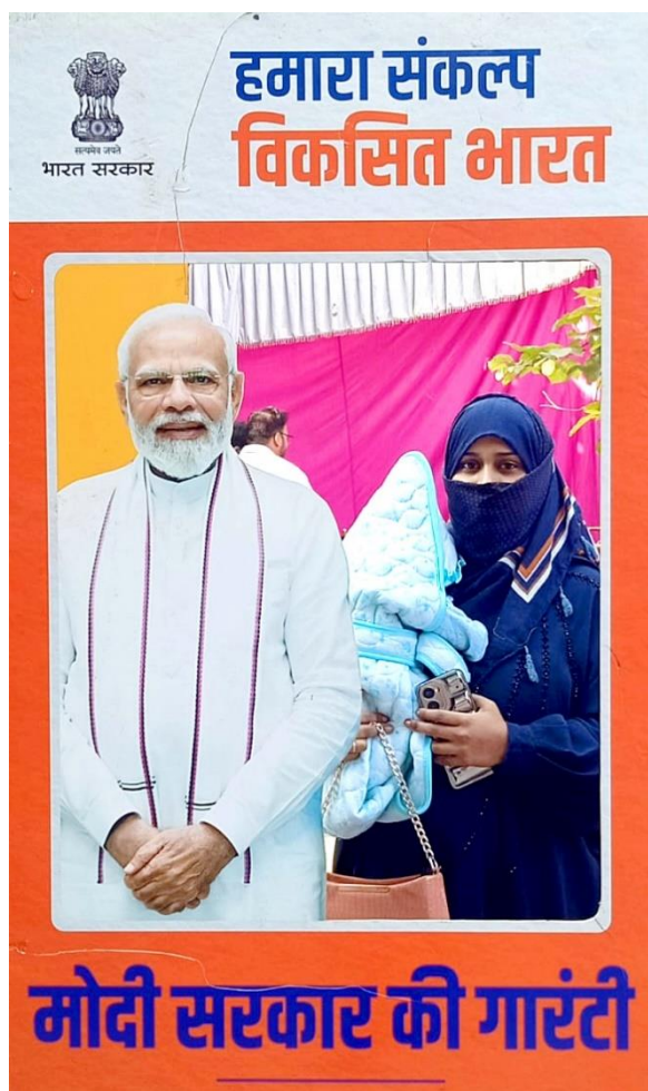
(A woman poses for a photo at a selfie point installed during 'Viksit Bharat Sankalp Yatra' at Bara Hindu Rao, in New Delhi)

The Viksit Bharat Sankalp Yatra is a nationwide effort aimed at achieving 100% saturation of the Government's key initiatives, ensuring that their benefits reach all intended recipients.