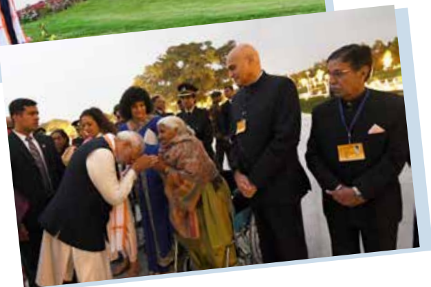
Hon'ble Prime Minister on the occasion of dedication of National War Memorial to the Nation on 25 February 2019.