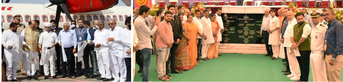
Union Minister for Civil Aviation Jyotiraditya Scindia launching commercial air service between Keshod to Mumbai

The Government has been considering having a separate and autonomous organization to cater to the increasing demand for the creation and maintenance of infrastructure in the civil aviation sector in the State of Gujarat. Initiatives in line with the same are as follows: