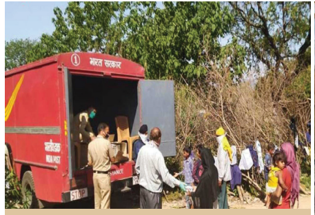
Food packets were distributed to 1000 needy people residing in slum areas by the Postal Store of Chandigarh Division, Punjab Circle in collaboration with Food Supply Department, Chandigarh.