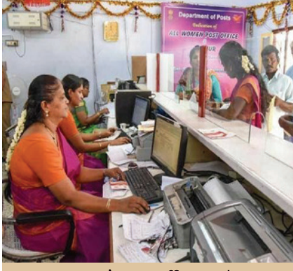
Women's Post Office, Puthur, Tamil Nadu