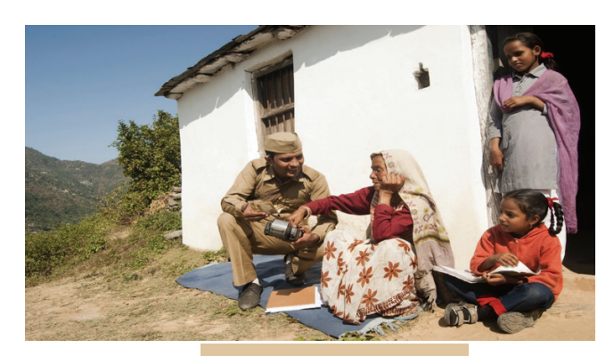
Payment at Doorsteps