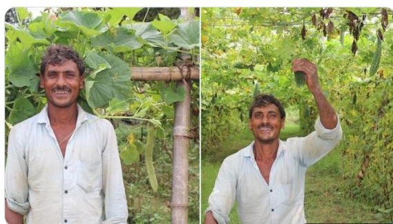
9:58 AM · Dec 14, 2021 · Twitter for iPhone

Enabling esp. the marginal farmers to get more from their land, trellis farming or machan kheti is transforming the manner in which the farmers of the #AspirationalDistrict of Balrampur look at multi-tier, sustainable, eco-friendly farming; Angrez Bhaiya's story's one of many: