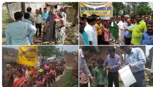
PMO India and 5 others

#VoicesOfChange: 'Padhe Balrampur-Badhe Balrampur' campaign of DM #Balrampur #UttarPradesh involving local communities, teachers, collaboration b/w departments & rallies by students transformed education! 54747 new students enrolled & attendance improved! #AspirationalDistricts