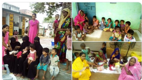
PMO India and 8 others

#AspirationalDistrict Chitrakoot in #UttarPradesh has shown a notable 40% fall in Severe Acute #Malnutrition among children under five. Focus on infant & young child feeding, immunization and treatment of childhood infections are key interventions towards a healthier district