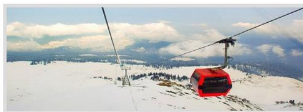
Gangtok - Sikkim Tourism