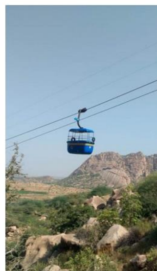
Karni Mata, Udaipur