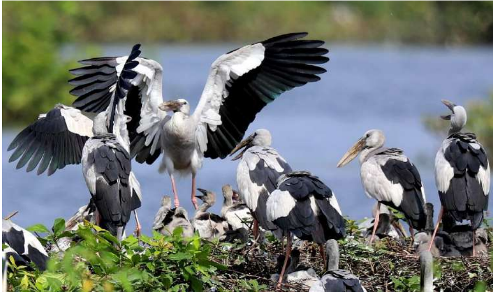
Figure: Foraging ground in Vedanthangal