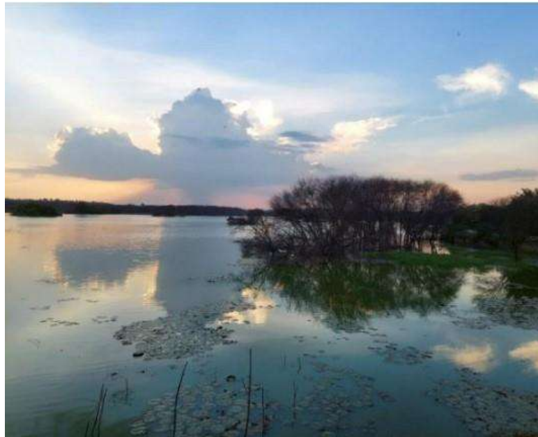
Figure: Panoramic view of Vellode Bird Sanctuary