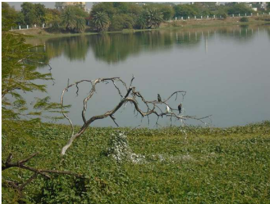
Figure: Resting site of Heronry birds.