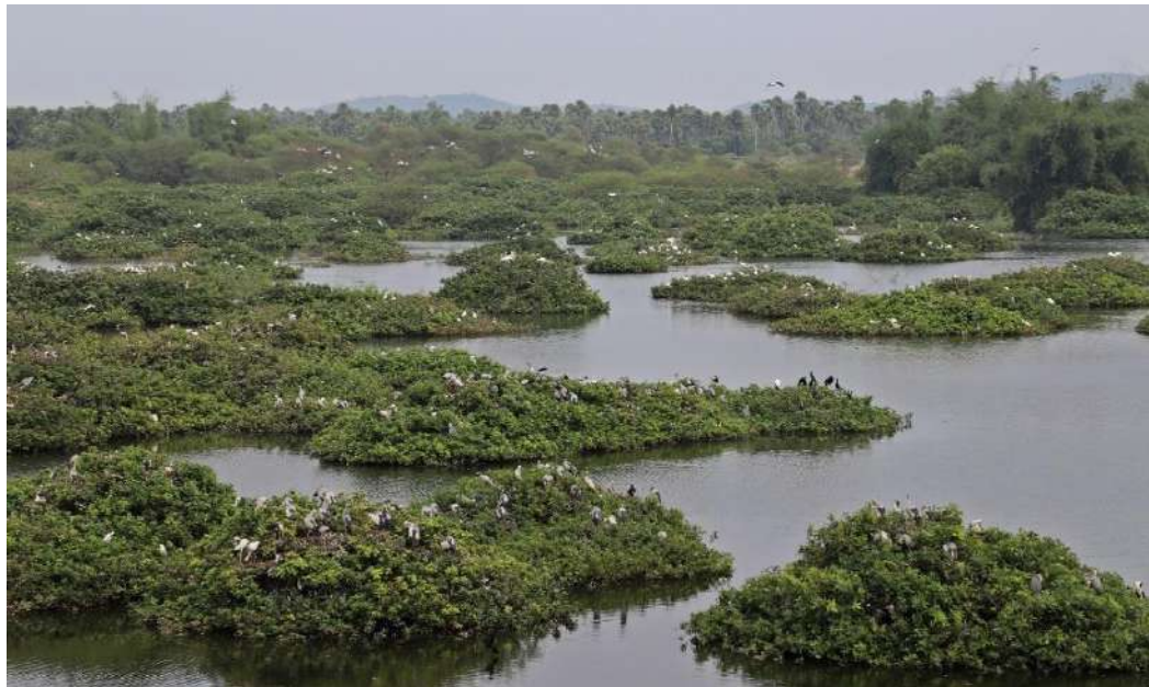
Figure: Panoramic view of the Vedanthangal