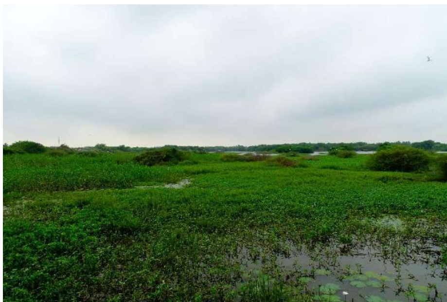
Figure: Udhayamarthandapuram wetland.