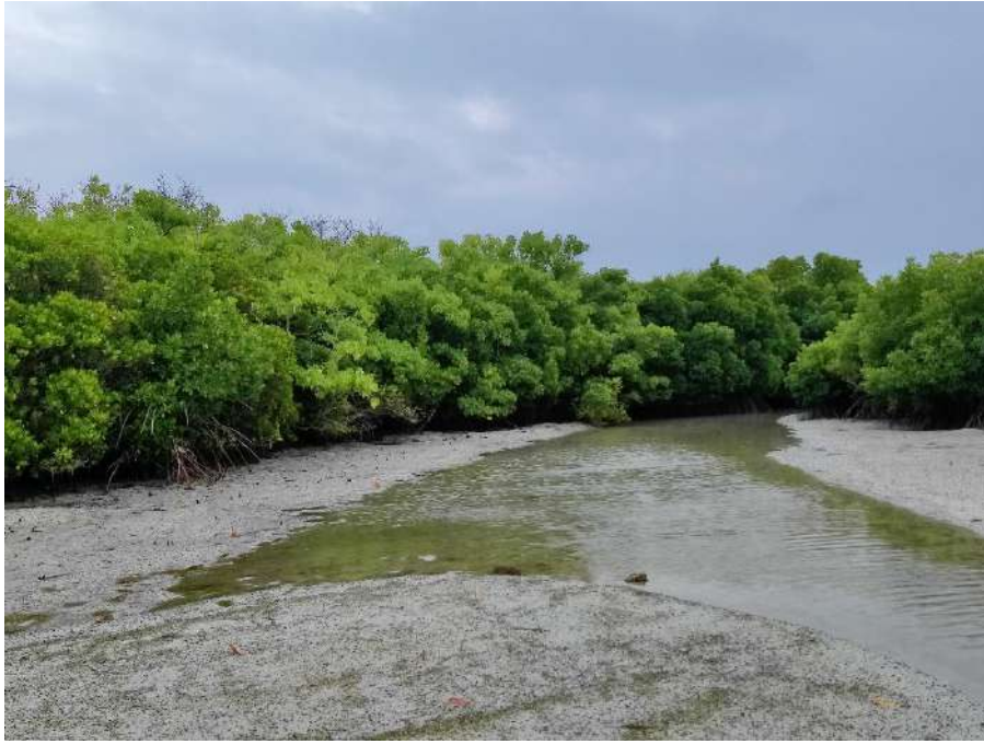
Figure: Mangrove cover in Mannar Biosphere Reserve