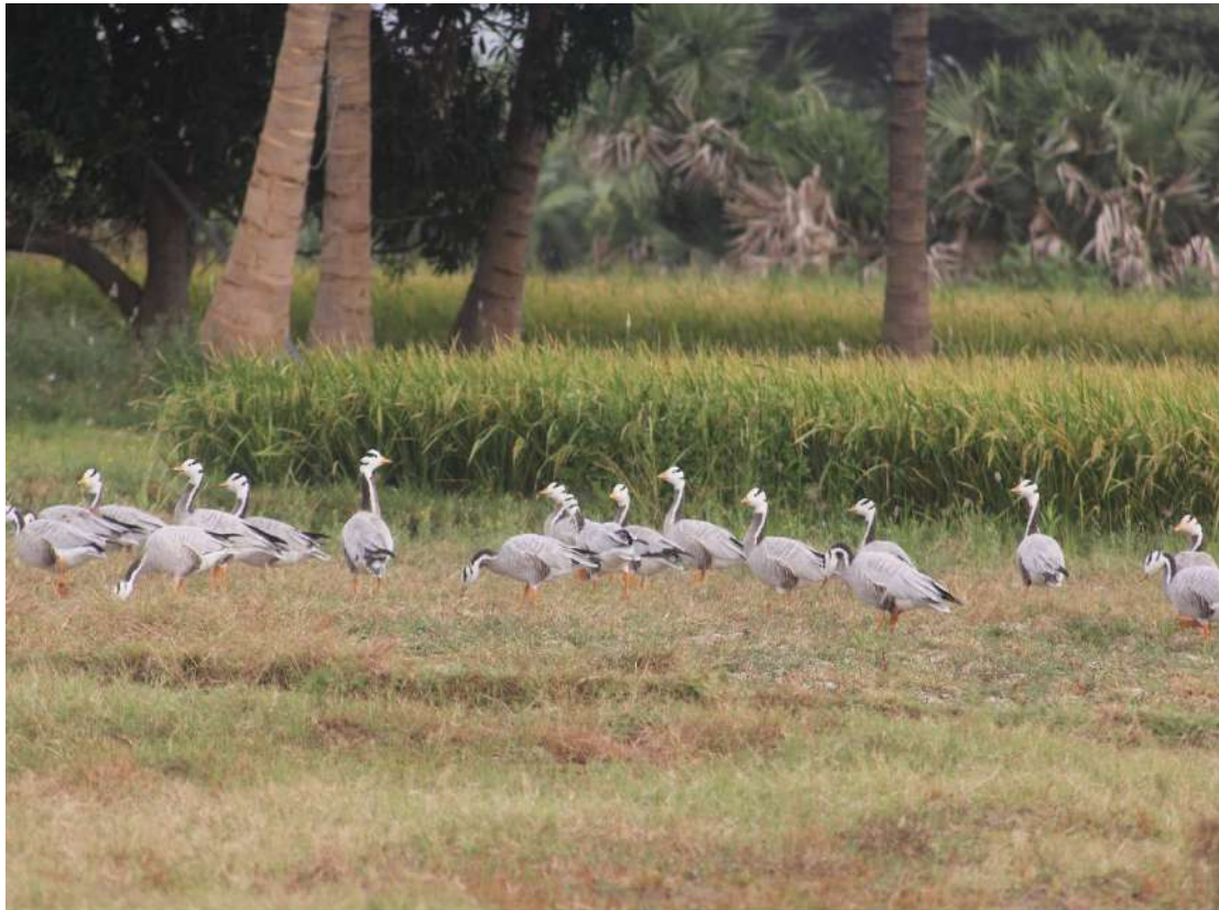
KOONTHANKULAM BIRD SANCTUAR-BAR HEADED GOOSE FEEDING IN NEARBY PADY FIELD