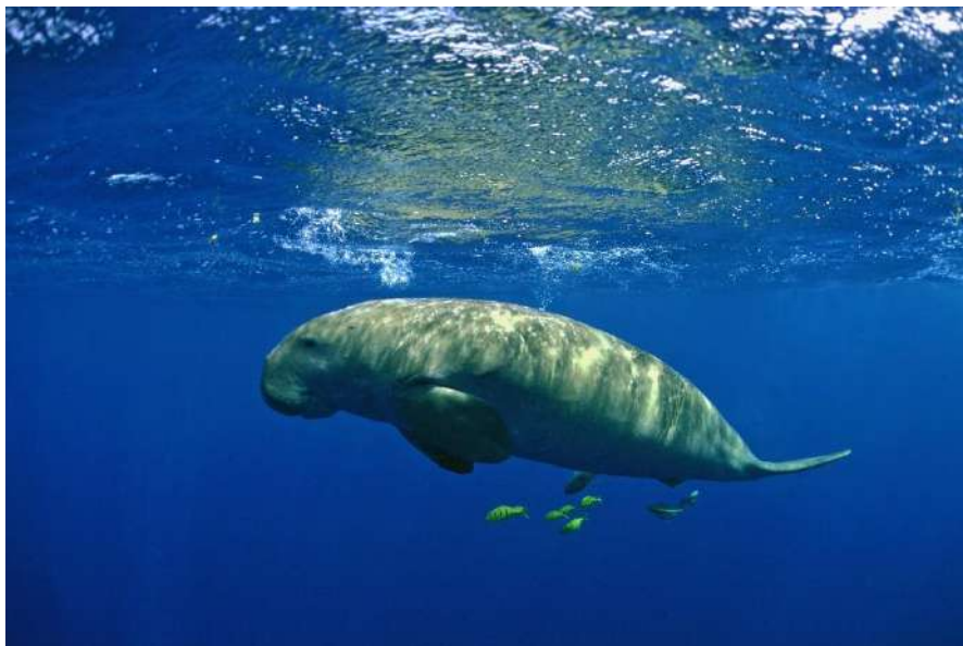
Figure: Gulf of Mannar Marine Biosphere Reserve: Dugong