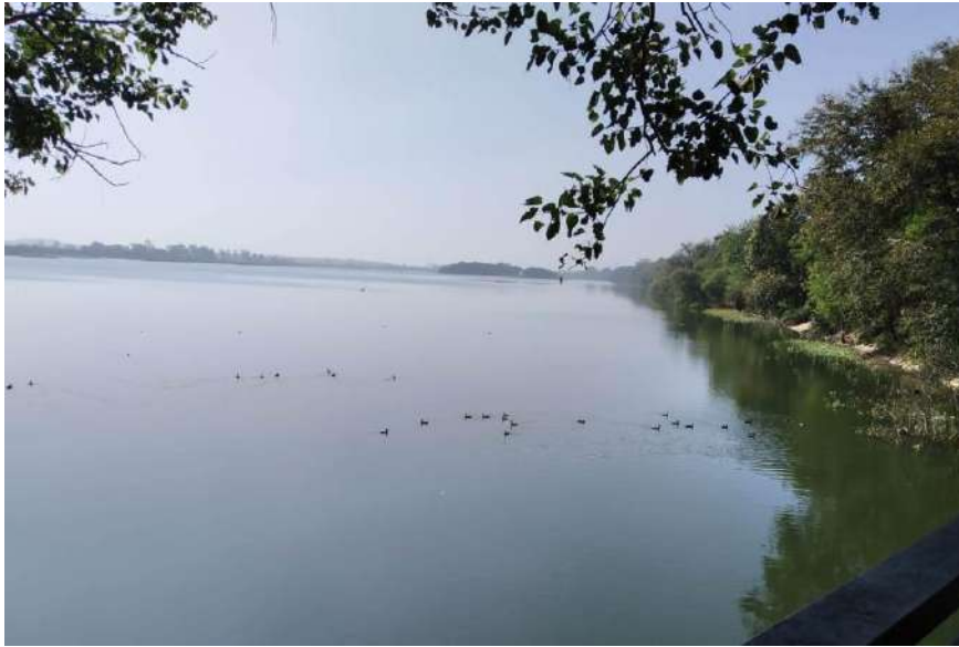
Figure: Migration Season in the wetland.