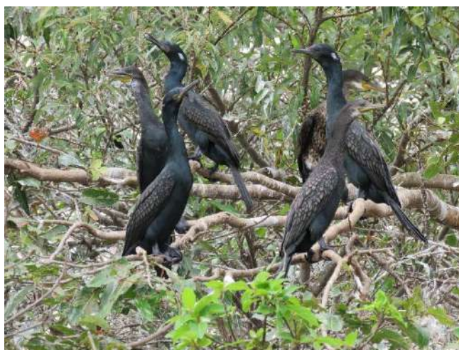
Figure: Avian species (Indian Cormorant) spotted in the wetland.