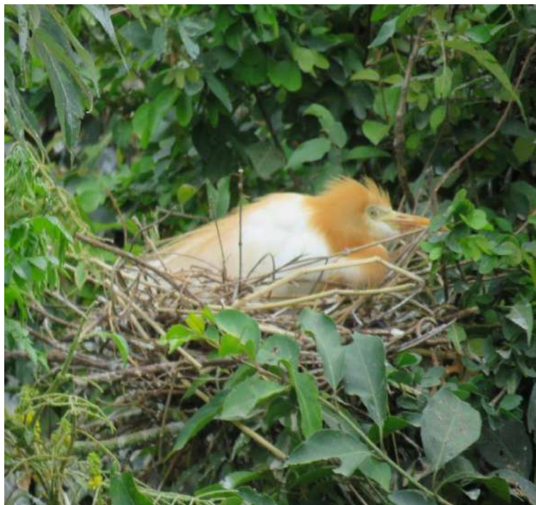
Figure: Cattle Egret Bubulcus ibis nesting at Ranganathittu