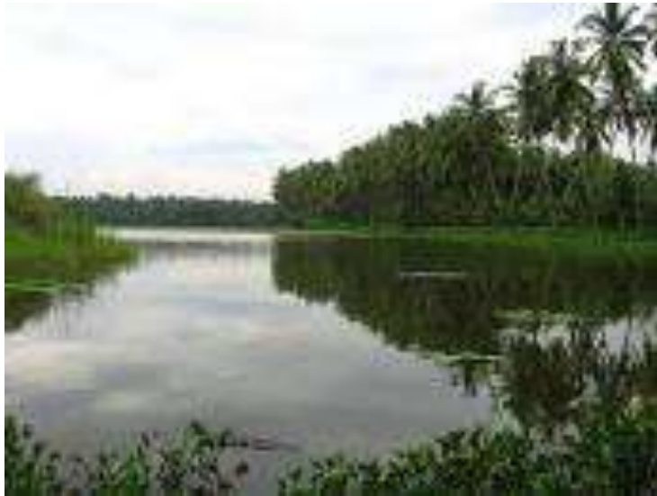
Figure: Vembannur Wetland