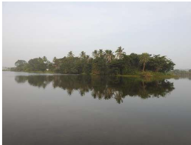
Figure: Devaraja Island on the wetland.