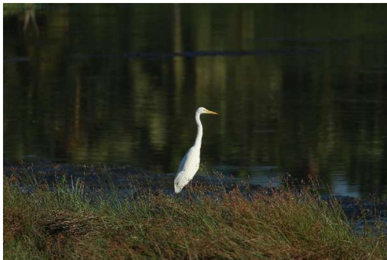
Figure: Vembannur Wetland - Indian Pond Heron.