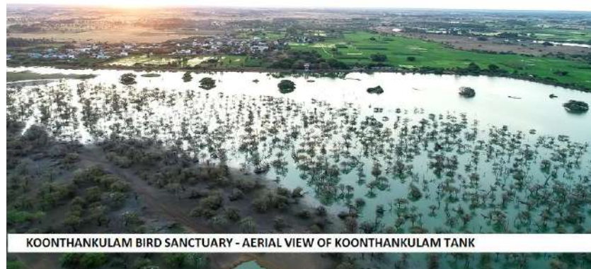
Figure: Aerial view of Koonthankulam Sanctuary