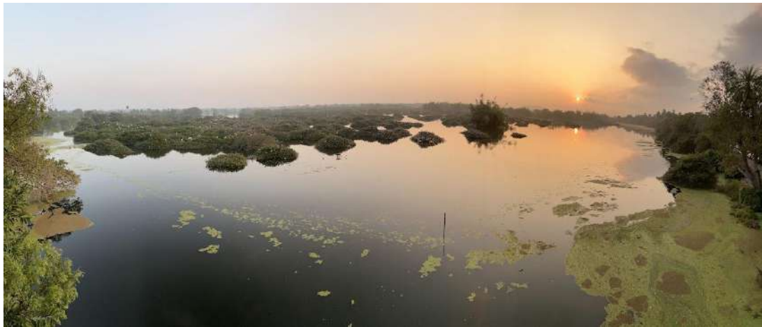
Figure: Panoramic view of the Vedanthangal