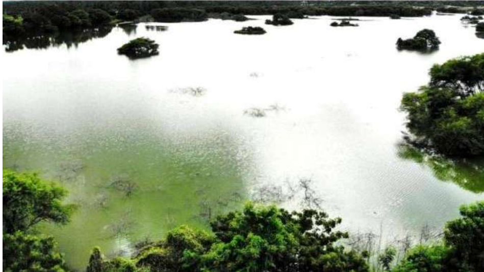
Figure: Panoramic view of Vellode Bird Sanctuary