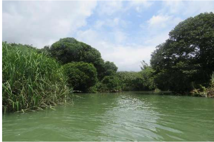
Figure: Arial view Ranganathittu Bird Sanctuary