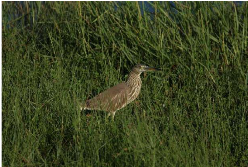
Figure: Vembannur Wetland -Avian species (Intermediate egret) spotted in the wetland.

purposes. The River Pazhayar and Vembannur wetland collects the entire drainage of the valley and irrigates a substantial part of Nanchilwadu.