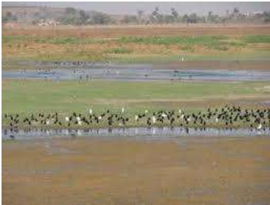
Figure: Watwrbirds at Sirpur lake