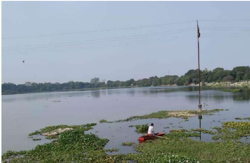
Figure: Sirpur wetland: Fishing Activities