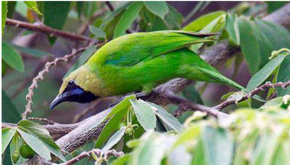
Figure: Vibrant Winged at Vellode Bird Sanctuary