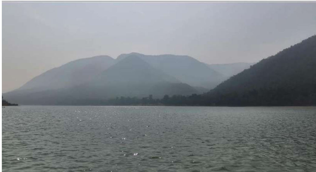
Figure: Arial View : Satkosia Gorge