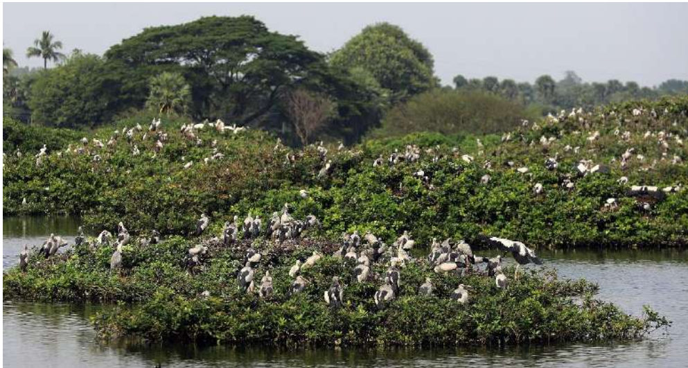
Figure: Nesting grounds in Vedanthangal