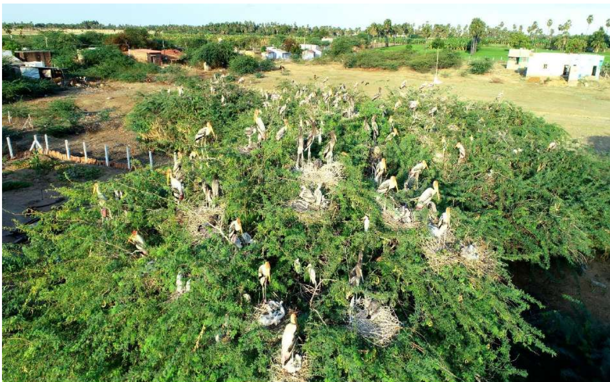
KOONTHANKULAM BIRD SANCTUARY - PAINTED STORK NESTING GROUND IN KOONTHANKULAM VILLAGE