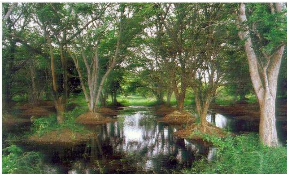
Figure: Panoramic view of the bird sanctuary

10. Udhayamarthandapuram Bird Sanctuary (Tamil Nadu): Udhayamarthandapuram Bird Sanctuary is located in the Tiruthuraipoondi Taluk of Tiruvarur district of Tamil Nadu . This is one of the important bird sanctuaries in Tamil Nadu. The site is an important staging and breeding ground for several species of waterbirds. The notable species observed at the site are oriental darter, glossy ibis, grey Heron & Eurasian spoonbill. It is one of the important breeding sites for the darter & Eurasian spoonbill. Udhayamarthandapuram stores floodwaters during monsoon overflows and maintains surface water flow during drier periods.