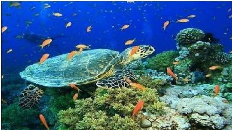
Figure: Gulf of Mannar Marine Biosphere Reserve - Olive ridley Turtle, corals