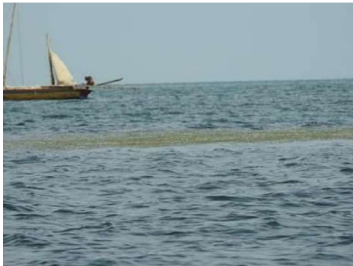
Figure: Panoramic view of Gulf of Mannar Marine Biosphere Reserve.