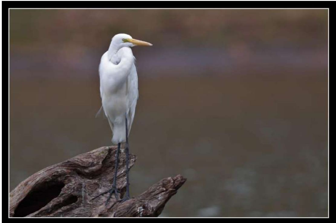
Figure: Satkosia Gorge : Great Egret