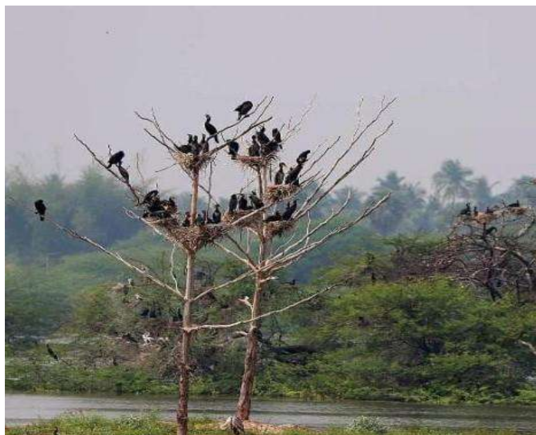
Figure: Avian nesting grounds in Vellode Bird Sanctuary