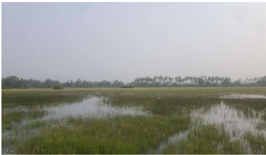
Figure: View of the Nanda Lake.