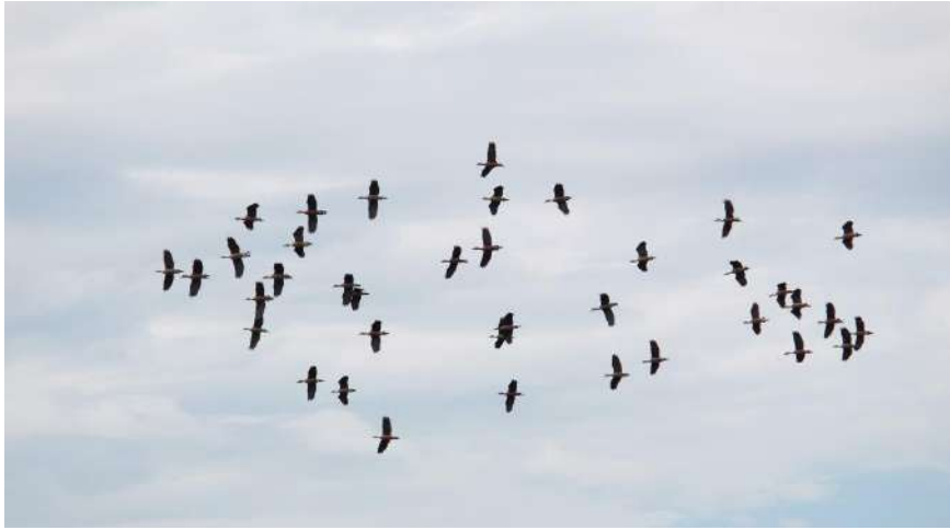
Figure: Vembannur Wetland - Flock of lesser whistling duck