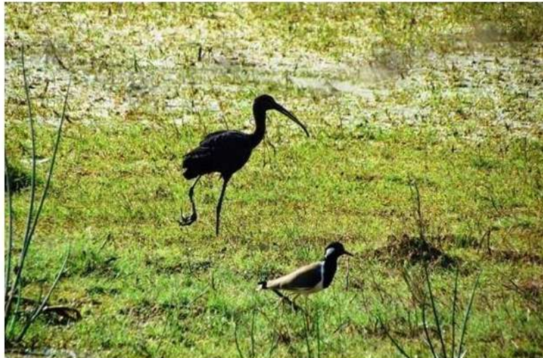
Figure: Udhayamarthandapuram wetland: Glossy Ibis and Red Wattled Lapwing