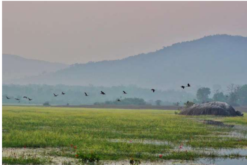
Figure: View of the Nanda Lake