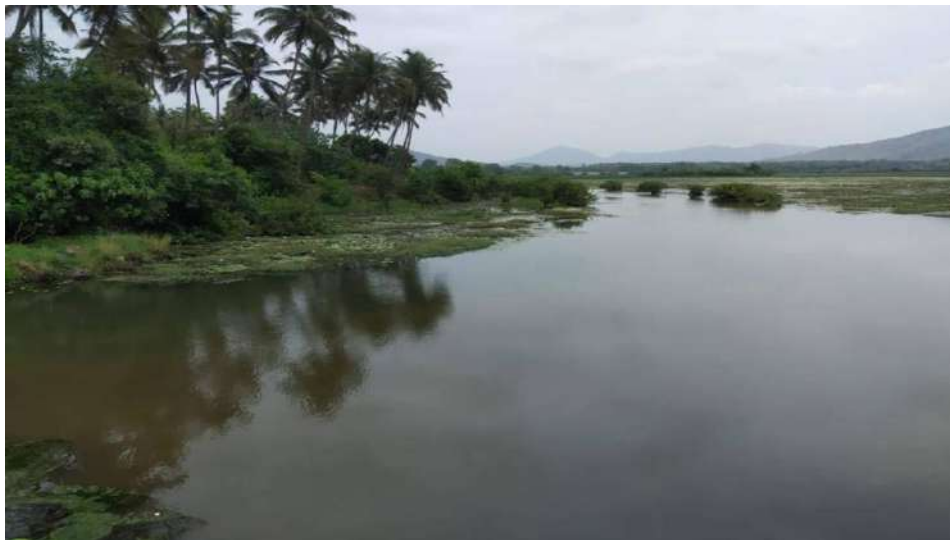
Figure: View of the Nanda Lake