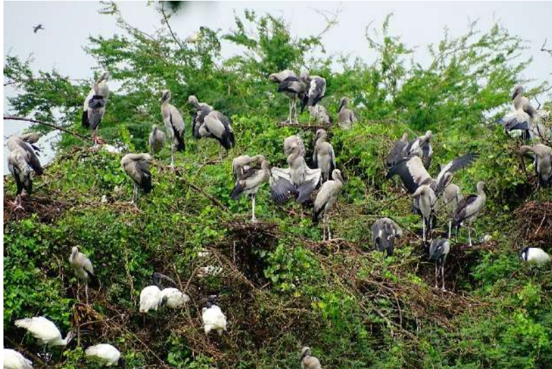
Figure: Udhayamarthandapuram wetland : Waterbirds