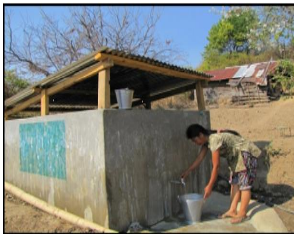
Drinking water supply at Ukhrul, Manipur Drinking water supply at West Khasi Hills, Meghalaya

4. Rural Roads and Rural Electrification: With the objective of enhancing communities' access to markets, health services, education facilities and energy, the component seeks to construct Common Facility Centres (CFCs), inter-village roads, culverts and suspension bridges and provide home solar lighting systems.