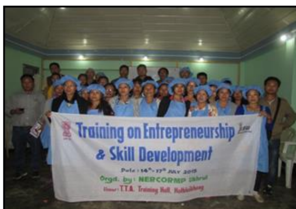
Training and Skill Development in Meghalaya