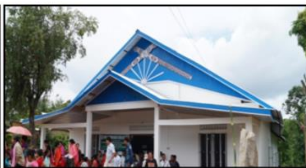
CFC in Riha Village, Ukhrul, Manipur