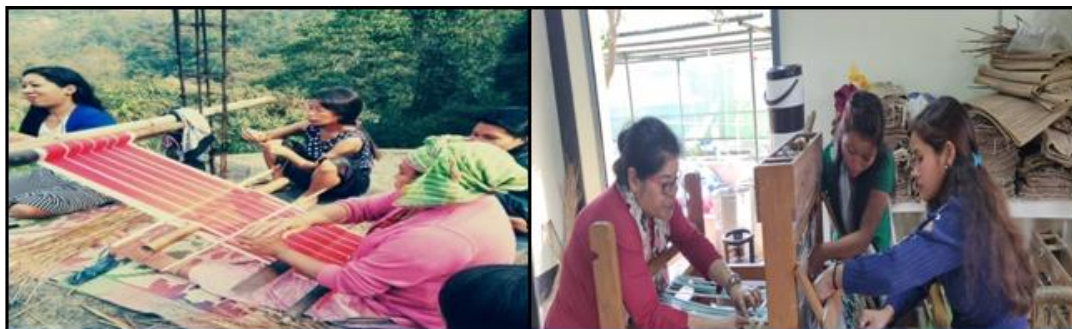
Large cardamon fibre craft (Initiative to convert waste into wealth) at Tirap, Arunachal Pradesh