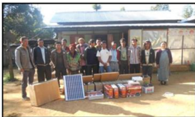
Home solar unit, Dima Hasao, Assam