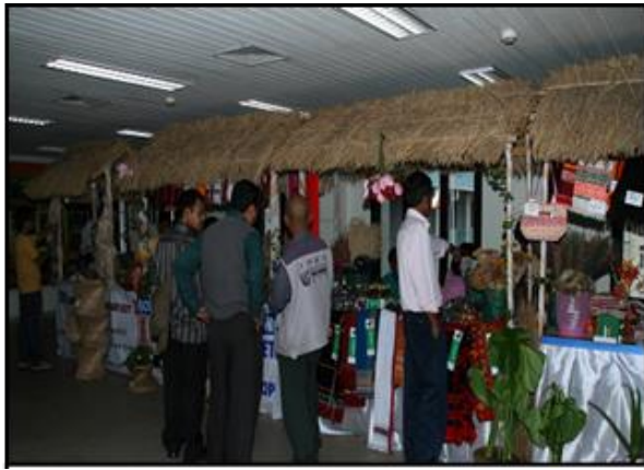
NKAT Fest 2019 at Shillong Meghalaya for showcasing and promoting community products