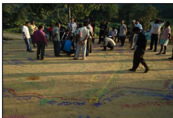
PRA Exercise at West Garo Hills, Meghalaya

2. Economic and livelihood activities: Promoting viable income generation activities (IGAs) for poor households through the production of field crops, horticulture, forestry, livestock, fisheries, and non-farm activities using sustainable and environmentally friendly practices. Efforts also include supporting communities with the introduction of new technologies, credit/revolving funds to CBOs for internal lending etc.