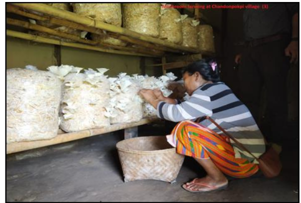
Mushroom cultivation in Chandel, Manipur