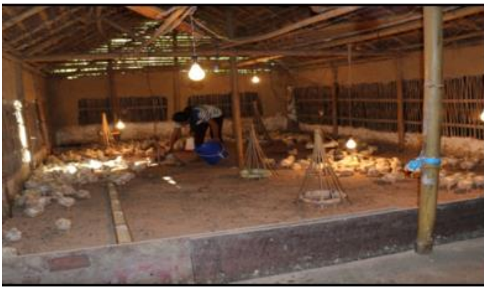
Poultry unit in Churachandpur, Manipur