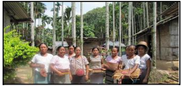
Water hyacinth craft products developed by SHGs in West Garo Hills, Meghalaya