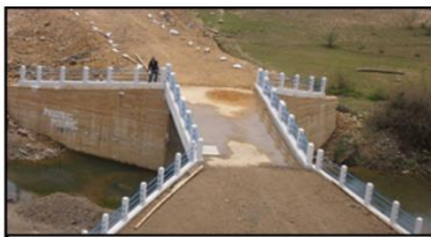
Seipei Komg bridge at Ukhrul, Manipur

4. Rural Roads and Rural Electrification: With the objective of enhancing communities' access to markets, health services, education facilities and energy, the component seeks to construct Common Facility Centres (CFCs), inter-village roads, culverts and suspension bridges and provide home solar lighting systems.