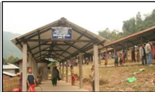
Market & collection shed, Dima Hasao, Assam