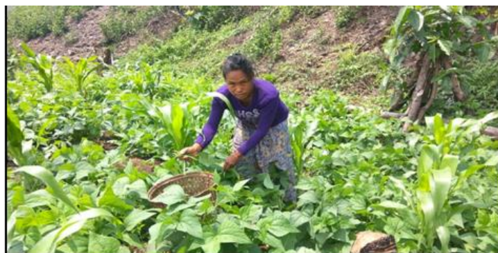
Vegetable cultivation in Tirap, Arunachal Pradesh