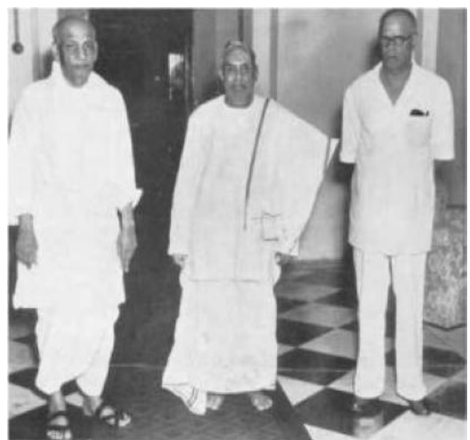
Patel with VP Menon (extreme right) and the Raja of Travancore