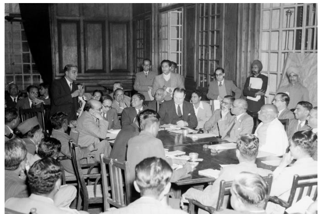
At a Press Conference on the Integration of States

The saga of accession unfolded with its own challenges and landmark achievements. In June 1947, Jodhpur, after having attempted negotiations for better terms with Pakistan, had acceded to India following several meetings and negotiations. Subsequently, in July 1947, Travancore had announced that it would assert its right to remain independent. Patel's diplomacy and statesmanship eventually brought the Raja of Travancore on board. This decision had a significant impact on the rulers of other states who had hitherto vacillated on the issue of Accession.