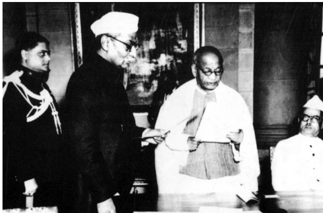
Dr Rajendra Prasad administers the Oath of Office to Sardar Patel

On 15 August 1947, Sardar Patel took oath as the first Deputy Prime Minister , as well as the first Home Minister of independent India. He also took charge of the Information and Broadcasting Ministry .