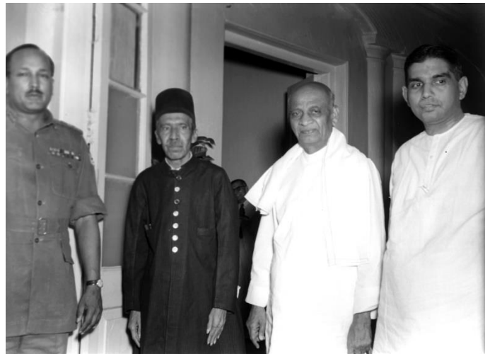
Sardar Patel with Nizam of Hyderabad

Sardar Patel's life and career is a lesson in grit, sagacity and decisive leadership. He earned the reputation of ' Iron Man ' because of the manner in which he brought about and maintained internal stability as Home Minister in the wake of the partition of the country.