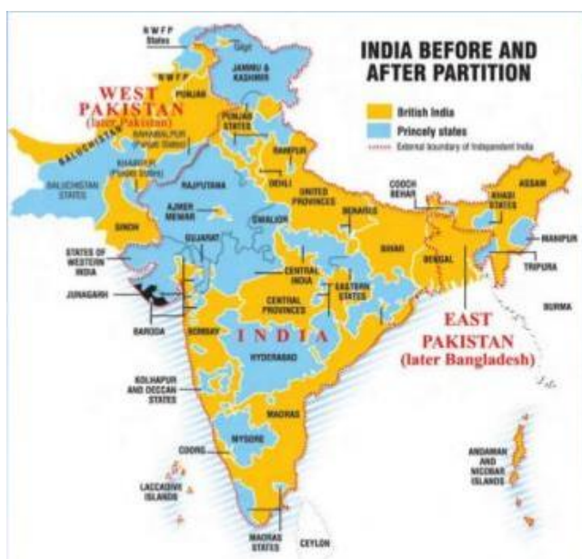
Map of British India and Princely States at the time of Independence

With the passing of the Indian Independence Act 1947, the long-cherished dream of freedom was finally at the doorstep. However, massive obstacles lay ahead. At the time of Independence, India consisted of British India and the Princely States. There were 17 British-Indian provinces, and the Princely States- comprising about two fifths of the geographic territory of the country- numbered more than 560. While the Indian Independence Act ceded control of British India to the Indian Government, rulers of the Princely States were given the option to decide whether they wanted to accede to India or Pakistan or neither.