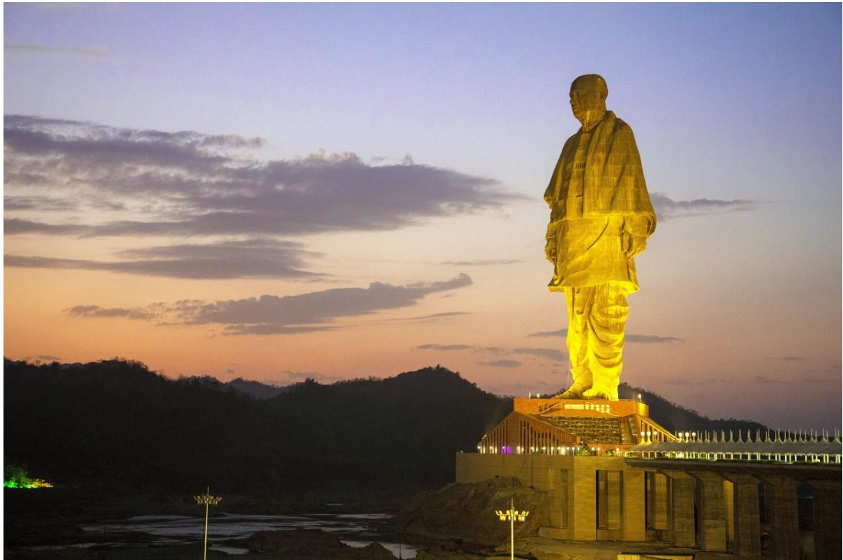
Statue of Unity at Kevadia. Gujarat

On 5 August 2019, Article 370 of the Constitution granting a temporary special status to Jammu and Kashmir was abrogated in recognition of J & K being an inalienable part of India. This completed the true unification and consolidation of the nation as Sardar Patel had envisioned.