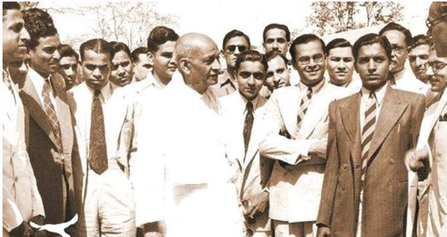
Sardar Patel with probationers of All India Services

Another illustrious contribution made by Sardar Patel was the creation of All India Services . He had envisioned these services as the ‘Steel frame of India’ that would further safeguard the country's unity and integrity. He considered the officers of the Services as partners in administration and expected them to maintain the highest standards of integrity and honesty.