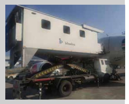
Ease of boarding through Ambu-lifts provided at airports