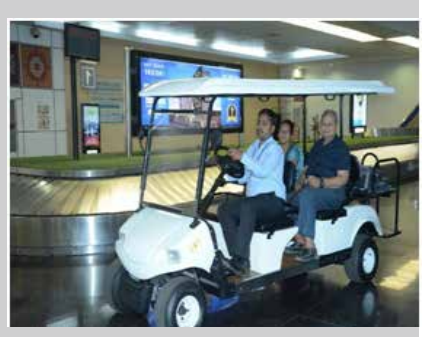
E-Cart services for easy transfers in Devi Ahilya Bai Holekar Airport, Indore, Madhya Pradesh