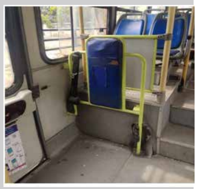
Space allocated for securing wheelchairs inside buses in Delhi Transport Corporation fleet