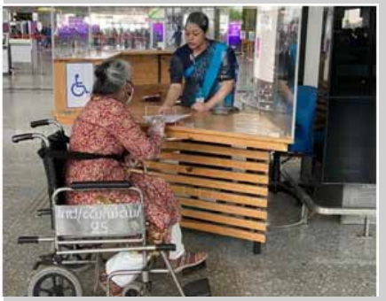
Low height counters for wheelchair users in Netaji Subhash Chandra Bose International Airport, Kolkata