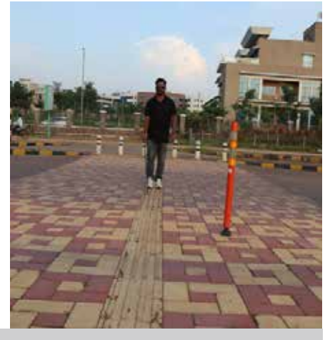
Naya Raipur Smart City designed with accessible walkways and pedestrian crossings