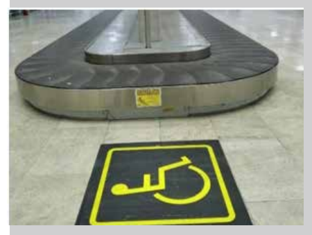
Well defined spaces reserved near baggage claim areas in Birsa Munda Airport, Ranchi, Jharkhand