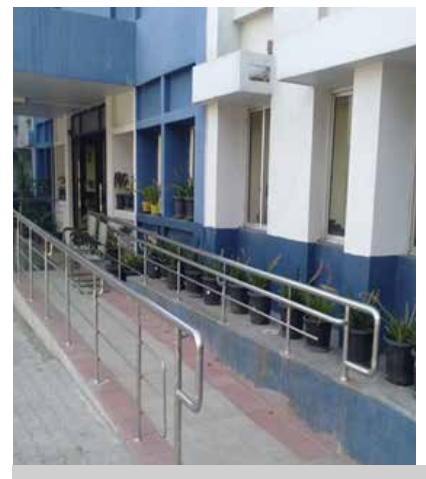
Ramp with double height handrails provided in Office of Accountant General, Kohima, Nagaland