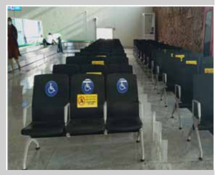
Reserved seating in Jharsuguda Airport, Odisha