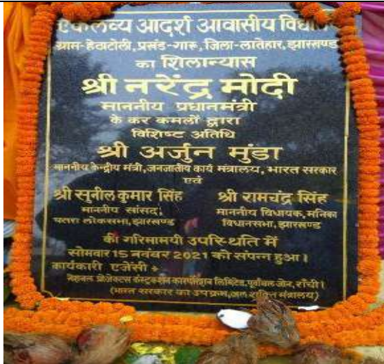
EMRS Garu, Latehar district, Jharkhand