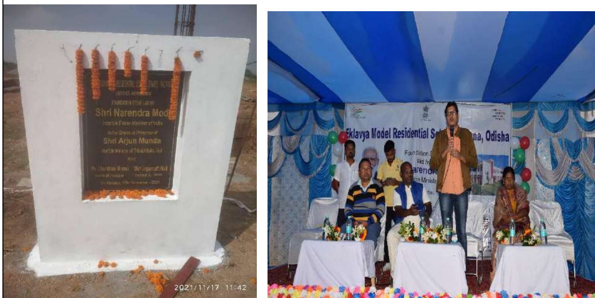
EMRS Patana, Kendujhar district, Odisha