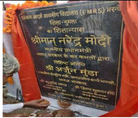
EMRS Bharno, Gumla district, Jharkhand