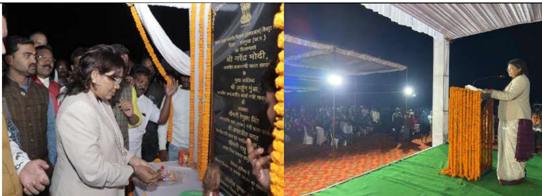
EMRS Batouli, Surguja district, Chhattisgarh

In Chhattisgarh, Smt. Renuka Singh Saruta, Minister of State of Tribal Affairs graced the occasion at the EMRS site in Batouli Block, Surguja District, Chhattisgarh. The other 3 schools are located in Pendra Road Gorella blocks in Bilaspur district, Mainpur block in Gariyaband district and Sitapur and Batouli blocks in Surguja district.