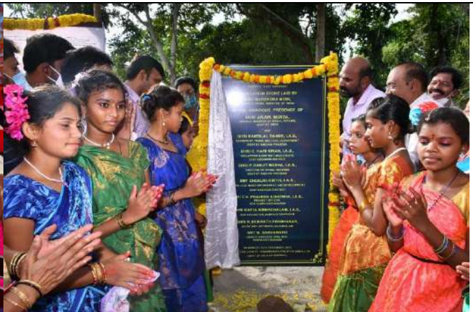
EMRS Adateegala, East Godavari district, Andhra Pradesh