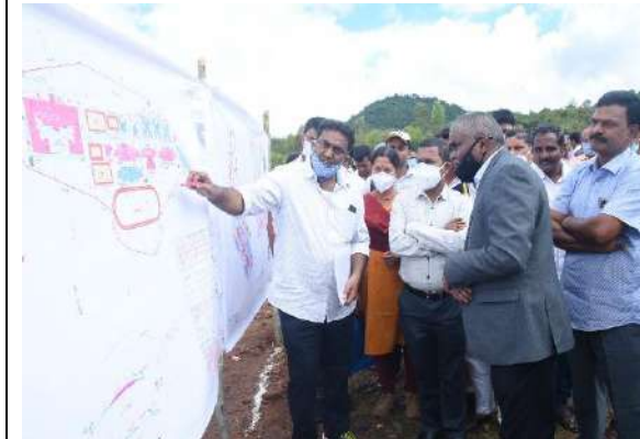
EMRS PedaBayalu, G. Madugula and Araku Valley, Vishakhapatnam district, Andhra