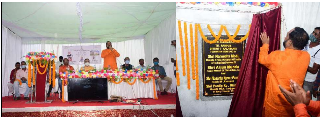
EMRS Thaumul Rampur, Kalahandi district, Odisha