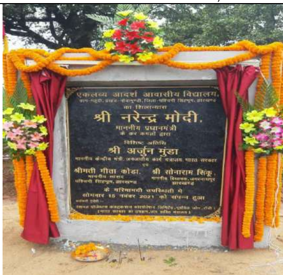
EMRS Noamundi, West Singhbhum district, Jharkhand