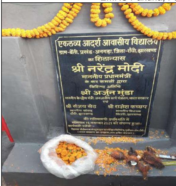
EMRS Angara, Ranchi district, Jharkhand