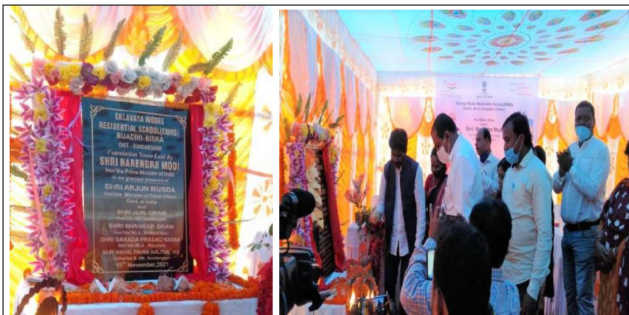
EMRS Bisra, Sundargarh district, Odisha