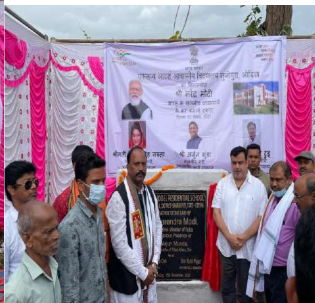
EMRS Jujomura, Sambalpur district, Odisha