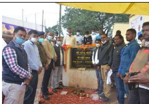
EMRS Tonto, West Singhbhum district, Jharkhand