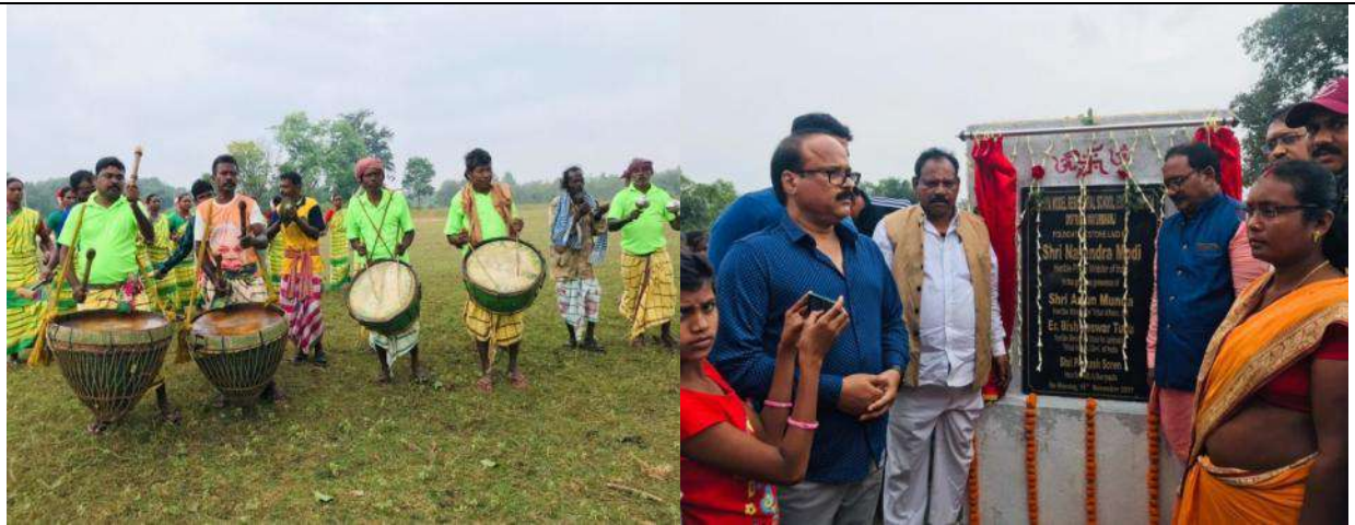
EMRS Baripada, Mayurbhanj district, Odisha