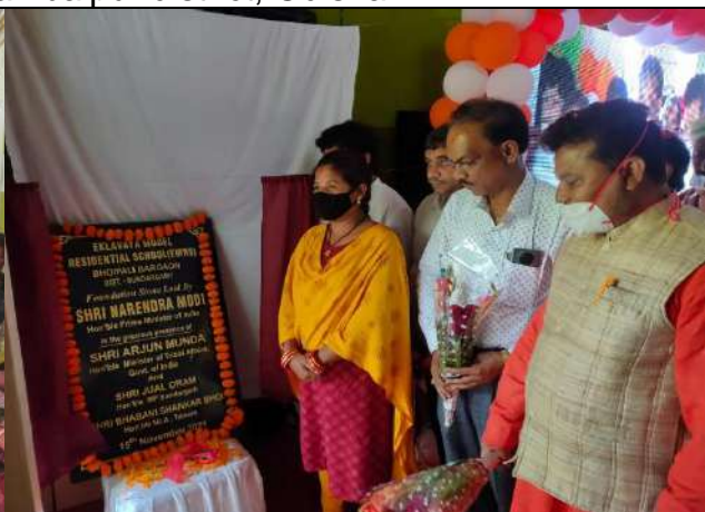
EMRS Baragaon, Sundargarh district, Odisha