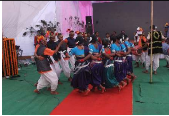
EMRS Pendra Road Gorella, Bilaspur district, Chhattisgarh