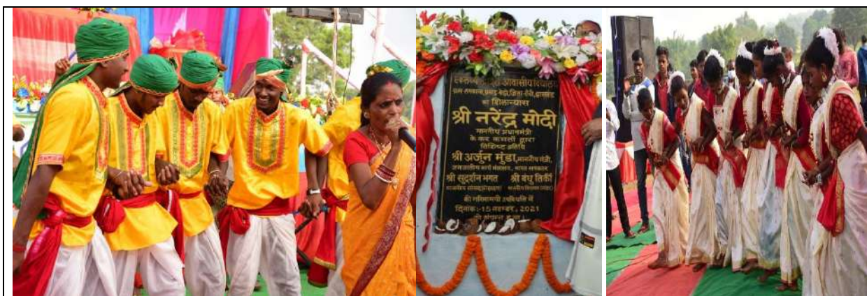
EMRS Bero, Ranchi district, Jharkhand