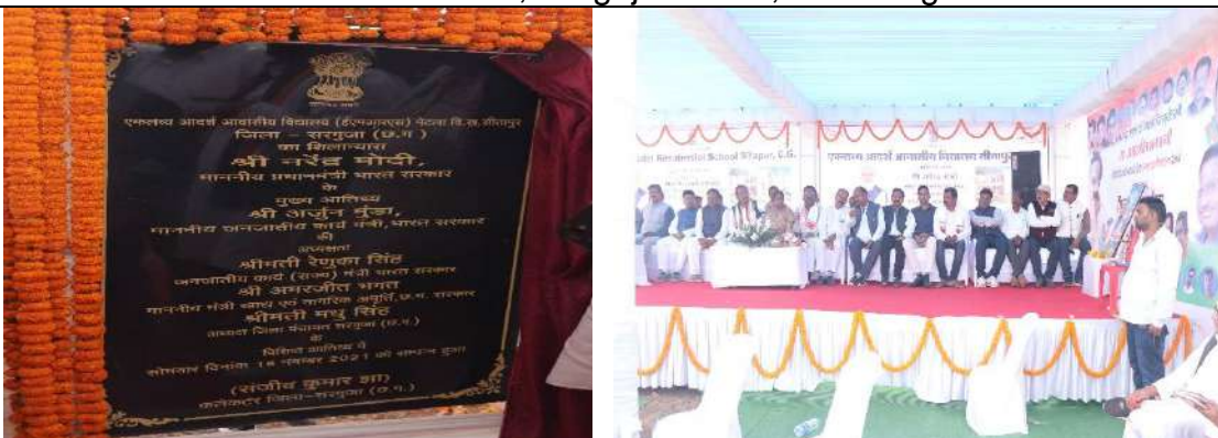
EMRS Sitapur, Surguja district, Chhattisgarh