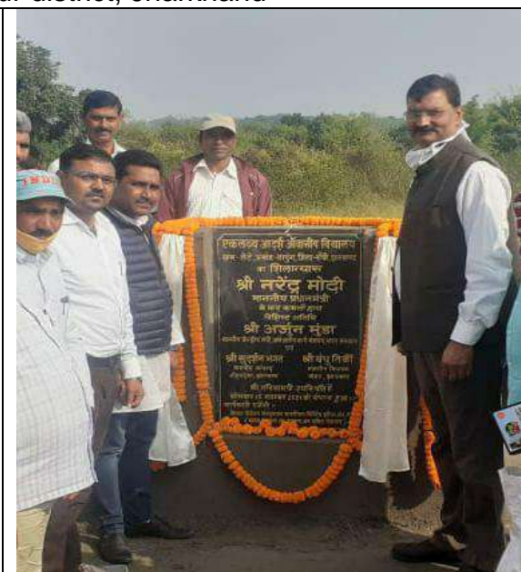
EMRS Lapung, Ranchi district, Jharkhand