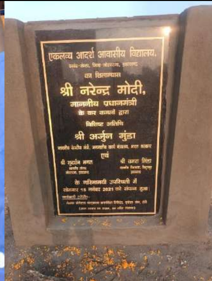
EMRS Senha, Lohardaga district, Jharkhand