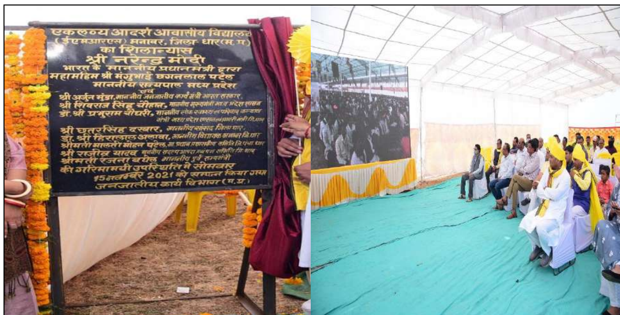
EMRS Manawar, Dhar district, Madhya Pradesh

Sh. Arjun Munda, Minister of Tribal Affairs joined the inauguration event from Jharkhand, where 20 schools were inaugurated. Political leaders representing the area, senior officials from the Ministry of Tribal Affairs, Government of India, State Government and public joined the event. Foundation stones were laid for 20 locations covering Sisai and Bharnoblocks in Gumla district, Barwadih and Garublocks in Latehar district, Senha, Bhadra, Peshrar, Kairo and Kiskoblocks in Lohardaga district, Pakuriya blocks in Pakur district, Angara, Lapung and Beroblocks in Ranchi district, Manjhari, Tonto, Naomundi, Manoharpur, Tantnagar, Sonua and Goilkera blocks in West Singhbhum district.