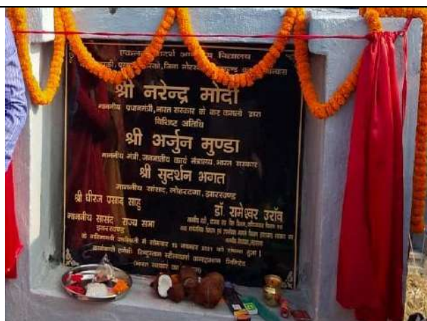
EMRS Kisko, Lohardaga district, Jharkhand