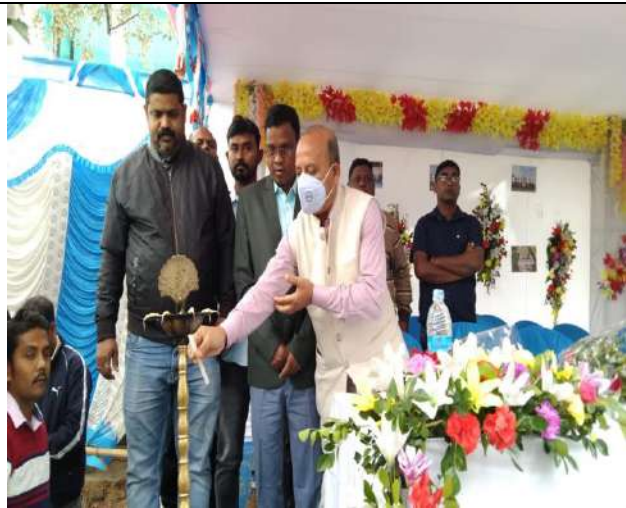
EMRS Manoharpur West Singhbhum district, Jharkhand