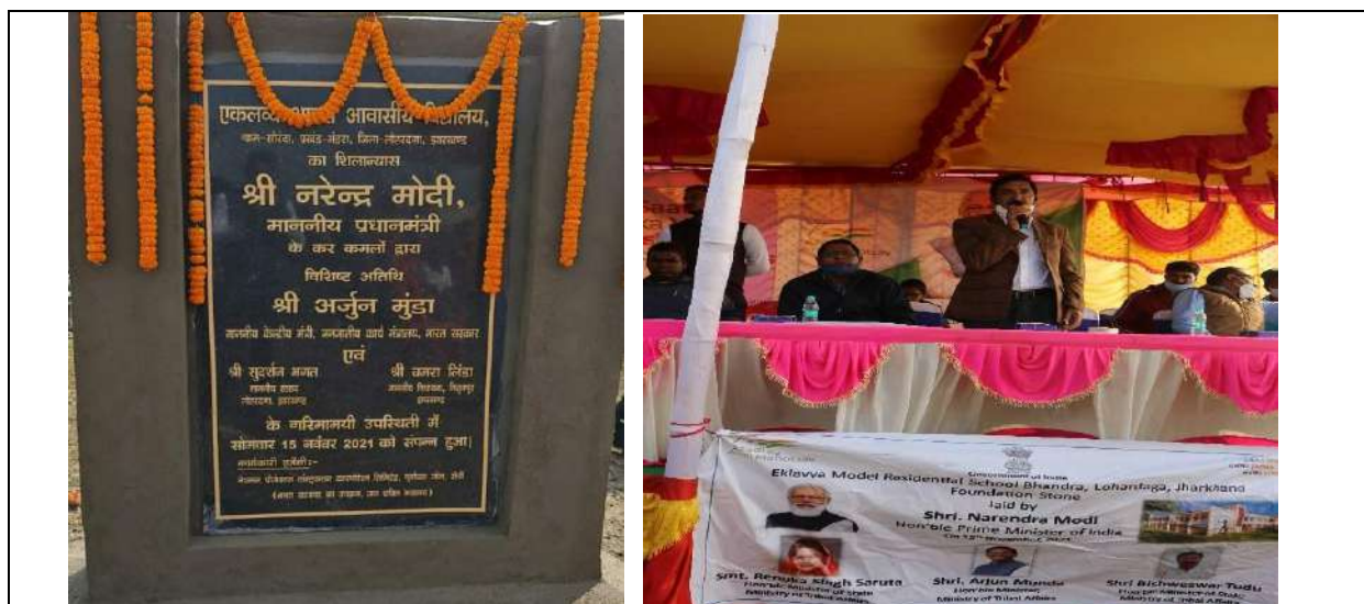
EMRS Bhandra, Lohardaga district, Jharkhand