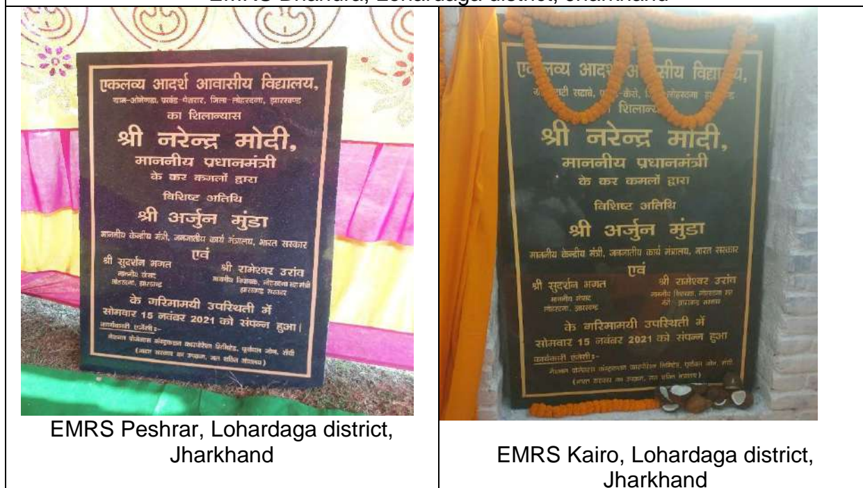
EMRS Peshrar, Lohardaga district, Jharkhand