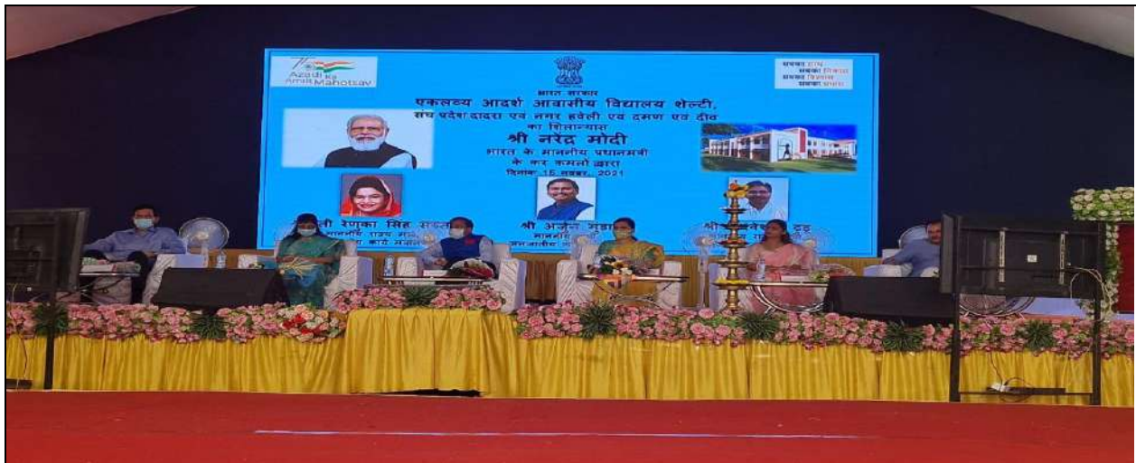
EMRS Dadra and Nagar Haveli, Dadra and Nagar Haveli district, Dadra and Nagar Haveli & Daman and Diu

In Dadra and Nagar Haveli foundation stone was laid for 1 location at Dadra and Nagar Haveli block in Dadra and Nagar Haveli district.