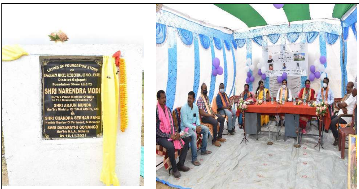
EMRS R. Udaygiri, Gajapati district, Odisha

In Odisha, foundation stones were laid for 15 locations covering R. Udaygiri block in Gajapati district, Thaumul Rampur block in Kalahandi district, Patana, Telkoi, Banspal (Nayakote) and Harichandpur blocks in Kendujhar district, Samakhunta and Baripada blocks in Mayurbhanj district, Paparhandi block in Nabrangpur district, Kalyansinghpur and Padmapur blocks in Rayagada district, Jujomura block in Sambalpur district and Baragaon, Bisra and Subdega blocks in Sundargarh district.