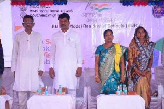
EMRS Mainpur, Gariyaband district, Chhattisgarh

In Andhra Pradesh, foundation stones were laid for 4 locations covering Addateegala block in East Godavari district and Peda Bayalu, G. Madugula and Araku Valley blocks in Vishakhapatnam district.