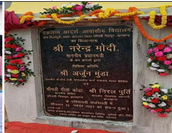
EMRS Tantnagar, West Singhbhum district, Jharkhand