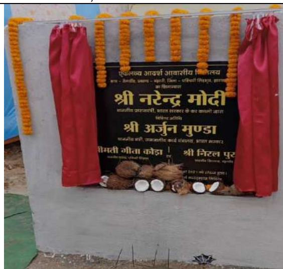
EMRS Manjhari, West Singhbhum district, Jharkhand