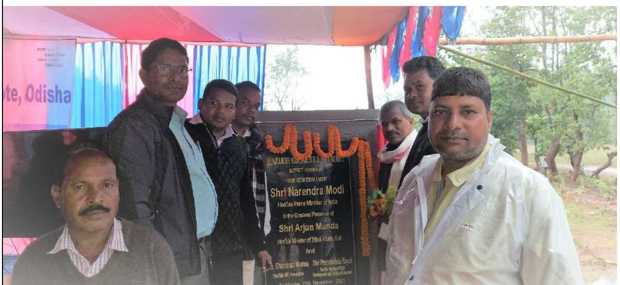
EMRS Banspal (Nayakote), Kendujhar district, Odisha