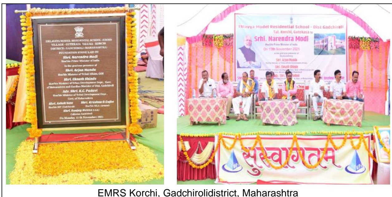
EMRS Korchi, Gadchiroli district, Maharashtra

In Odisha, foundation stones were laid for 15 locations covering R. Udaygiri block in Gajapati district, Thaumul Rampur block in Kalahandi district, Patana, Telkoi, Banspal (Nayakote) and Harichandpur blocks in Kendujhar district, Samakhunta and Baripada blocks in Mayurbhanj district, Paparhandi block in Nabrangpur district, Kalyansinghpur and Padmapur blocks in Rayagada district, Jujomura block in Sambalpur district and Baragaon, Bisra and Subdega blocks in Sundargarh district.