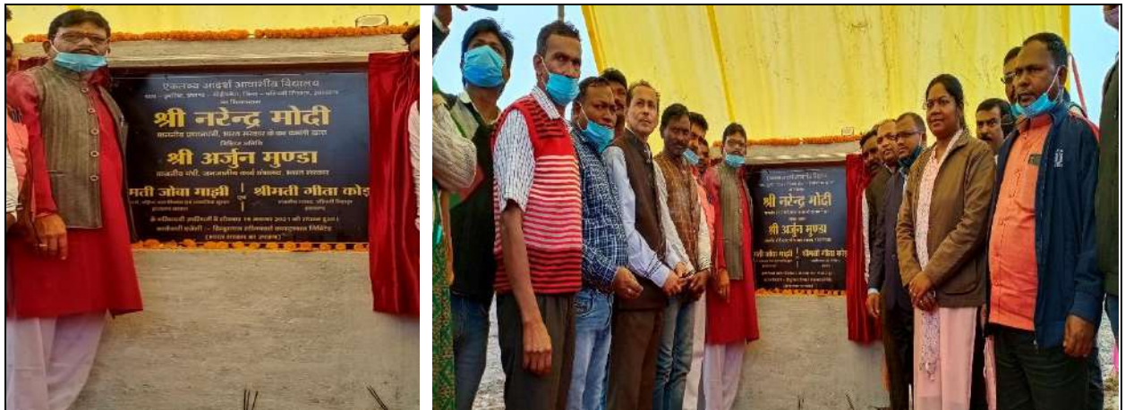
EMRS Goilker, West Singhbhum district, Jharkhand

In Chhattisgarh, Smt. Renuka Singh Saruta, Minister of State of Tribal Affairs graced the occasion at the EMRS site in Batouli Block, Surguja District, Chhattisgarh. The other 3 schools are located in Pendra Road Gorella blocks in Bilaspur district, Mainpur block in Gariyaband district and Sitapur and Batouli blocks in Surguja district.