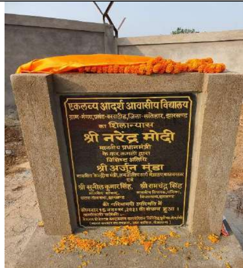
EMRS Barwadih, Latehar district, Jharkhand