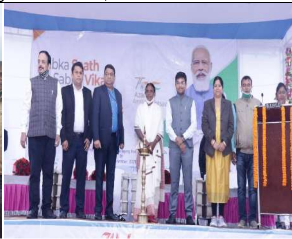
EMRS Sonua, West Singhbhum district, Jharkhand