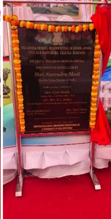
EMRS Dahanu, Palghar district, Maharashtra