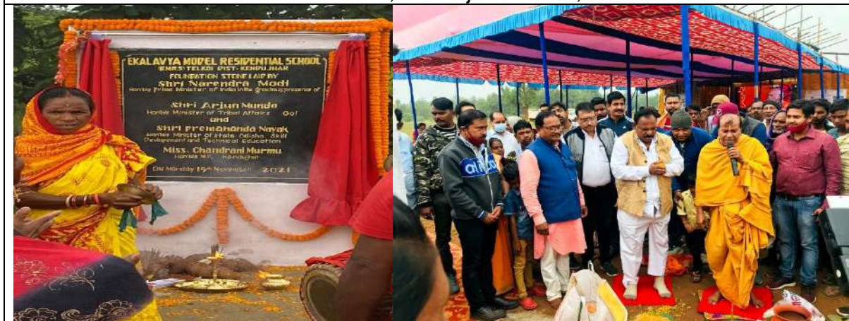
EMRS Telkoi, Kendujhar district, Odisha