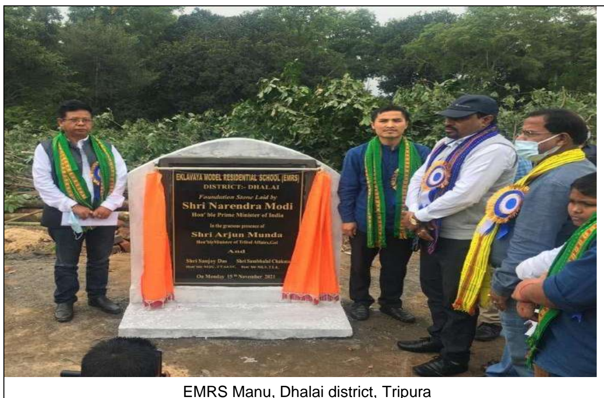
EMRS Manu, Dhalai district, Tripura

Eklavya Model Residential School (EMRS) is flagship scheme of Government of India to establish model residential schools for Indian Tribal students (Scheduled Tribes) across India..