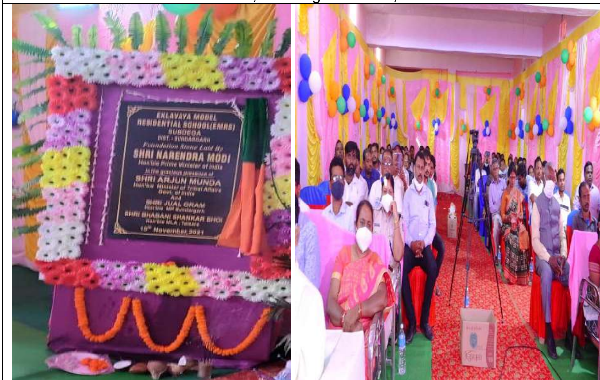
EMRS Subdega, Sundargarh district, Odisha

In Tripura, foundation stone was laid for 01 location covering Manu block in Dhalai district.