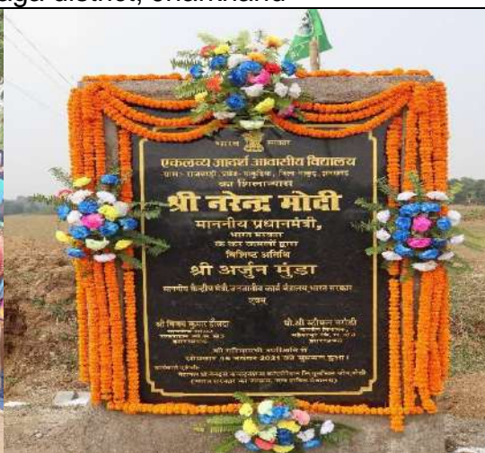
EMRS Pakuria, Pakur district, Jharkhand