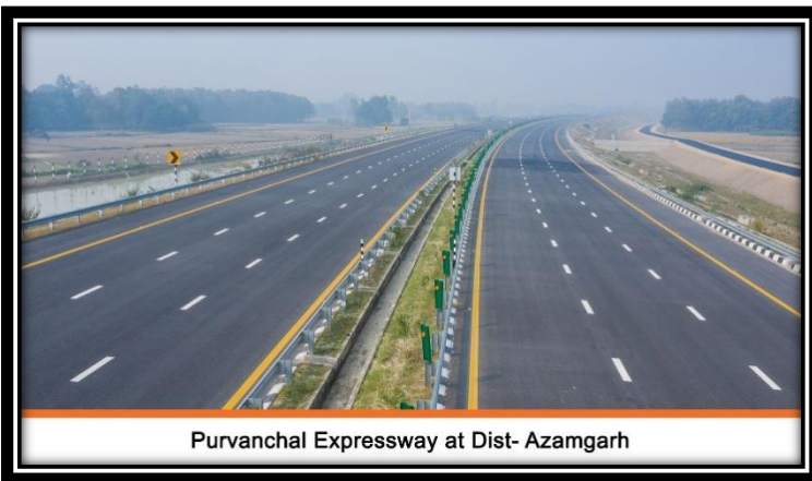
Purvanchal Expressway at Dist- Azamgarh