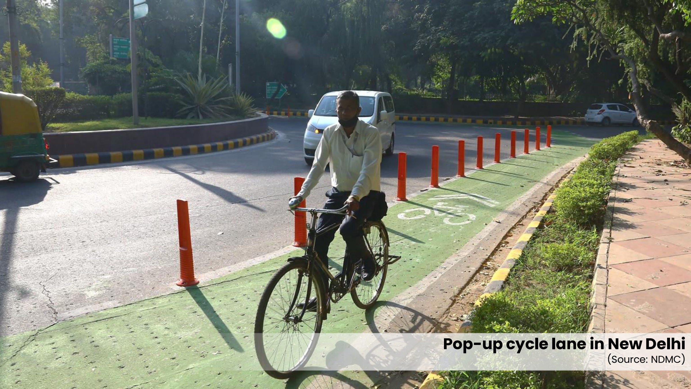
Pop-up cycle lane in New Delhi