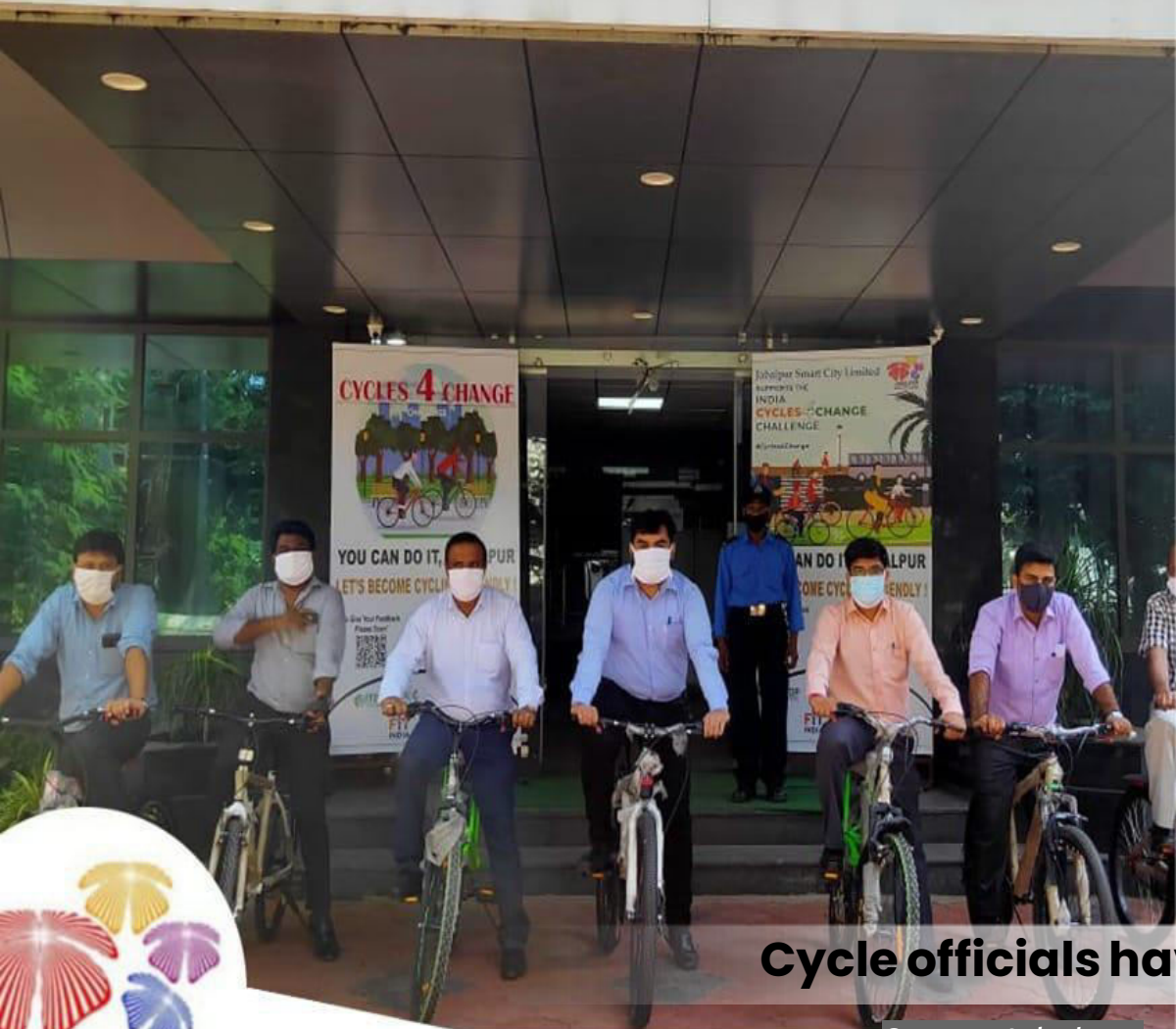
Cycle officials have led Cycle2Work campaigns to inspire cycling