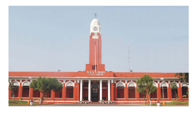
ICAR-INDIAN AGRICULTURAL RESEARCH INSTITUTE DEEMED UNIVERSITY, NEW DELHI