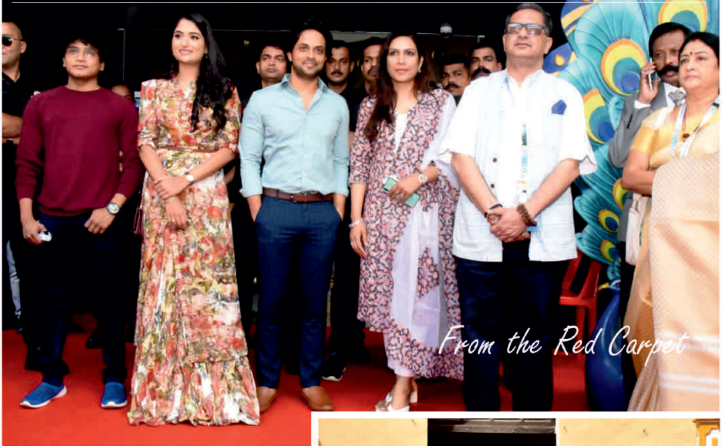
From the Red Carpet